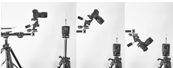
Figure 4: Geared-columns: camera/object relative motion

Geared tripod columns, and carefully designed assemblies of other commonly available photographic equipment, have allowed object / camera loci that reduce the range of relative motion between camera and object and the consequent alignment required, greatly increasing the speed and reliability of captures. Following initial experiments with more basic manual and powered turntables, these were replaced with readily available photographic 'motion controllers', able to be mathematically synced with the focus stacking software to allow 'one-click' captures for each camera angle.