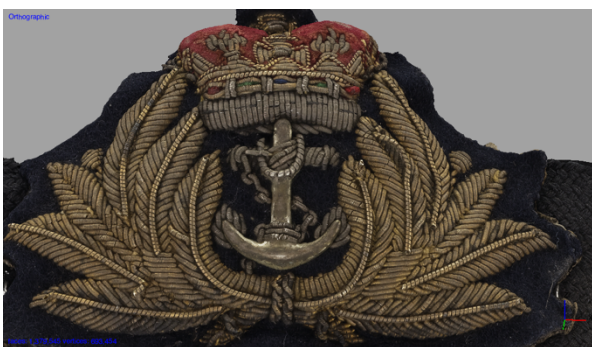
Figure 1: Textured Model of 1950s Naval cap badge

The artistic element of this project seeks to capture, re-examine and ultimately transform a range of military and religious insignia; cultural artefacts that share specific materials and processes, as well as powerfully interrelated iconographies and histories. These objects bear the traces of their making, use and age in minute material detail. Their reflective metal embroidery forms complex image-objects, often on richly textured fabric grounds, presenting a particular challenge for their digital capture.