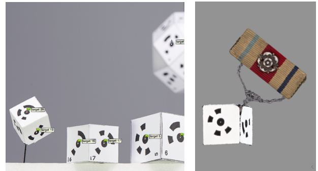
Figure 5: Coded target objects & WWII Medal Bar model

Coded and non-coded targets are used extensively in archaeology, anthropology and paleontology to aid the alignment of images and reconstruction of fragmentary captures into whole objects or unified terrains. By developing prototype 3-dimensional computer-coded devices with appropriate camera-sensor-to-target scales and face angles, it has been possible to use automated target recognition to help reliably capture small, symmetrical, monochrome or reflective artifacts that cannot be treated with surface sprays, or marked to assist with feature recognition.