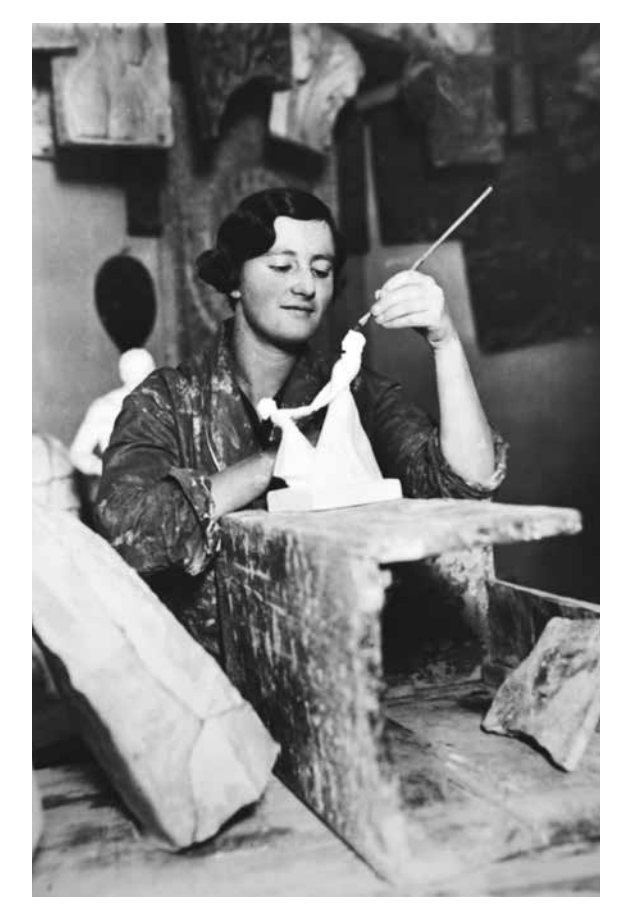
Modelling workshop, 1936

forming, decorating and glazing processes were taught, including mould-making, casting, and the jigger and jolly machine, which were industrial rather than craft processes, and ceramic chemistry lessons. Other classes in the department were in studies from the figure, draped and nude, composition, lettering, casting in plaster and metal, and carving in wood, stone and ivory. There was also a mosaic and mural decoration class.