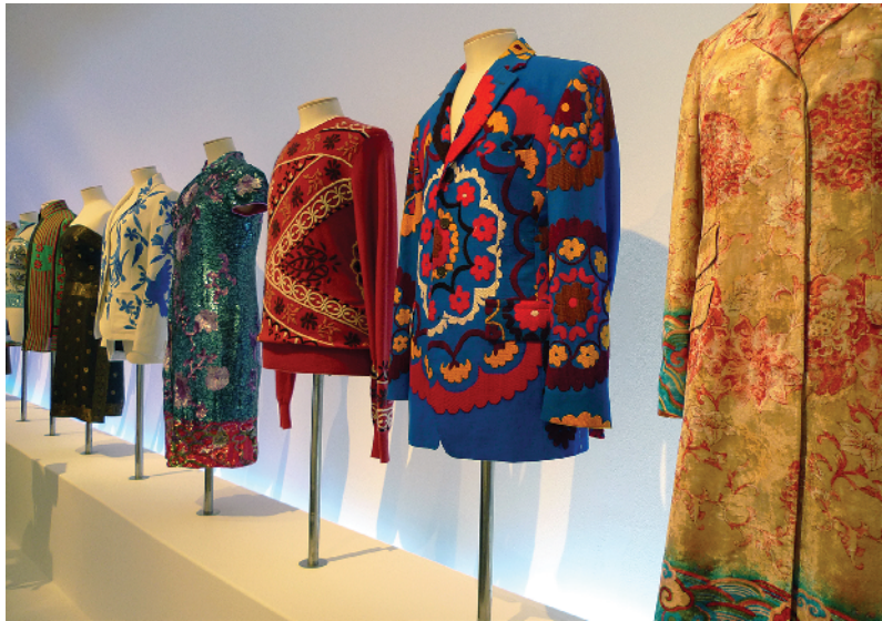
Figure 1: Hello! My Name is Paul Smith. Installation shot showing men's and women's garments presented on tailors' forms.