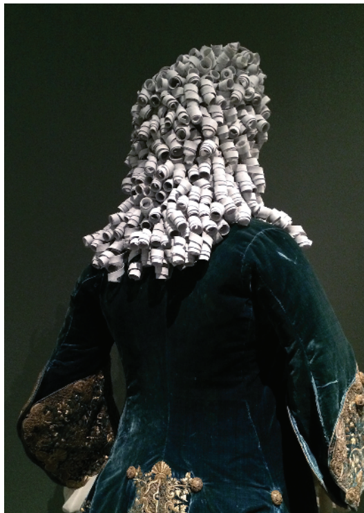
Figure 5: Reigning Men. Back view of a wig made to complement an eighteenth-century ensemble.

Full mannequins were used for the complete looks and the range of garments to be fitted necessitated the use of five different mannequin types with a variety of facial configuration. As can be seen in the photographs that illustrate the accompanying publication, considerable thought was given to the gesture and stance of each mannequin so that its pose reflected its given