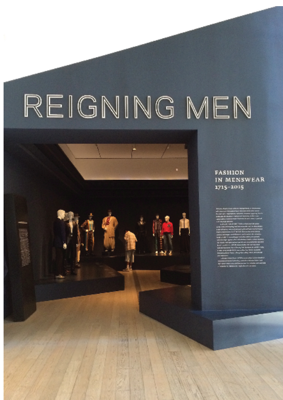
Figure 4: Reigning Men. Installation shot showing the entrance to the exhibition.