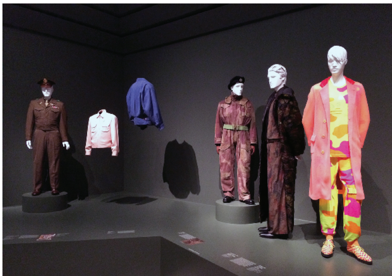
Figure 3: Reigning Men. Installation shot showing the section on Military Wear.