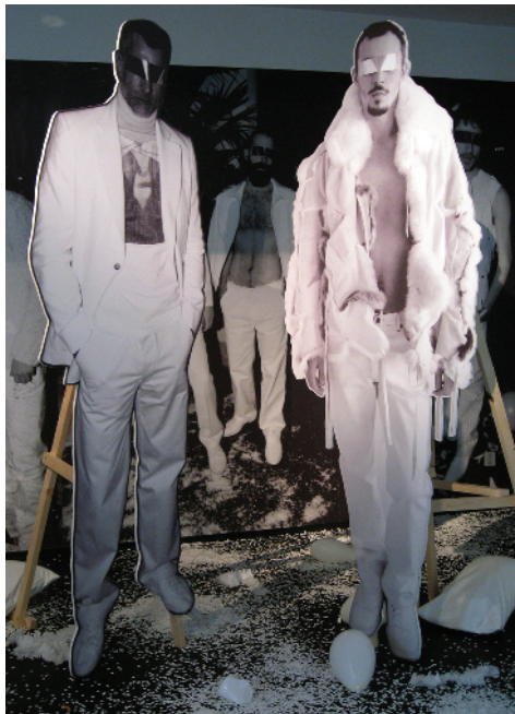
Figure 2: Maison Martin Margiela '20' The Exhibition. Installation shot showing menswear represented by life-size photographic images.

Some design houses who at the time their monographic exhibitions were staged had celebrated menswear lines preferred not to include menswear in their exhibition selection. Alexander McQueen: Savage Beauty did not include representation of the McQueen brand's menswear line. Design duo Viktor & Rolf (Viktor Horsting and Rolf Snoeren) excluded menswear from both of their monographs; Viktor & Rolf par Viktor & Rolf: Première Décennie and The House of Viktor & Rolf . Of note is that the designers' brand image was closely tied to their menswear: they were regularly photographed wearing items from their menswear collections and, indeed, they used themselves as runway and look-book models for several collections (Viktor & Rolf n.d.). Maison Martin Margiela '20' The Exhibition , structured over 23 thematic sections, featured over 150 items. Despite having a number of creative and commercially viable menswear lines under the brand only a handful of men's garments were displayed (ModeMuseum 2009). The section titled Maison Martin Margiela 'Men', the last section of the exhibition, comprised only photographic representation of the house's menswear lines (Figure 2).