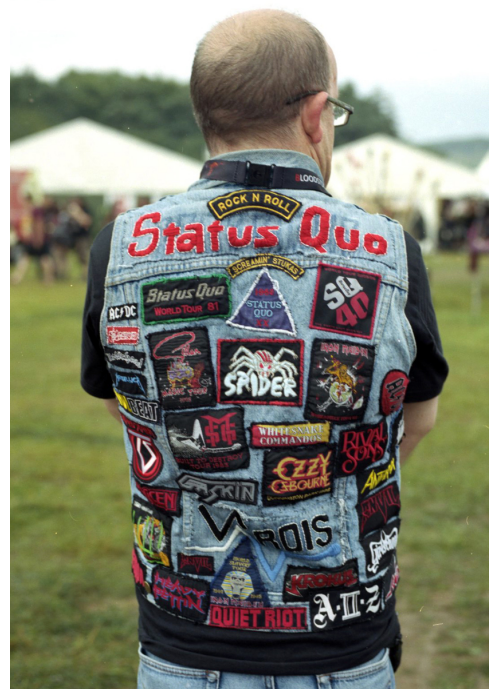
Examples of hand embroidered jackets, Bloodstock Festival, UK, August 2014