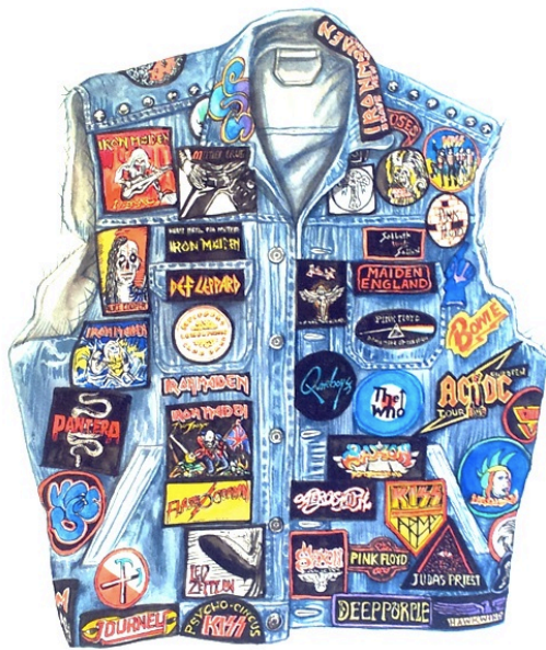
Tom Helyar-Cardwell Aiden's Jacket Front , watercolour on paper, 38 x 26 cms, 2014