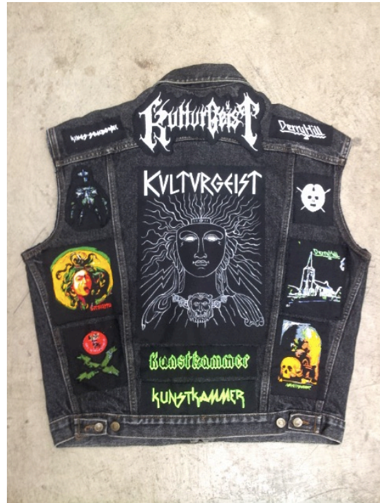
Tom Helyar-Cardwell Kulturgeist , denim vest with custom-made patches, 2014

juxtaposing images from different traditions with those of metal subculture.