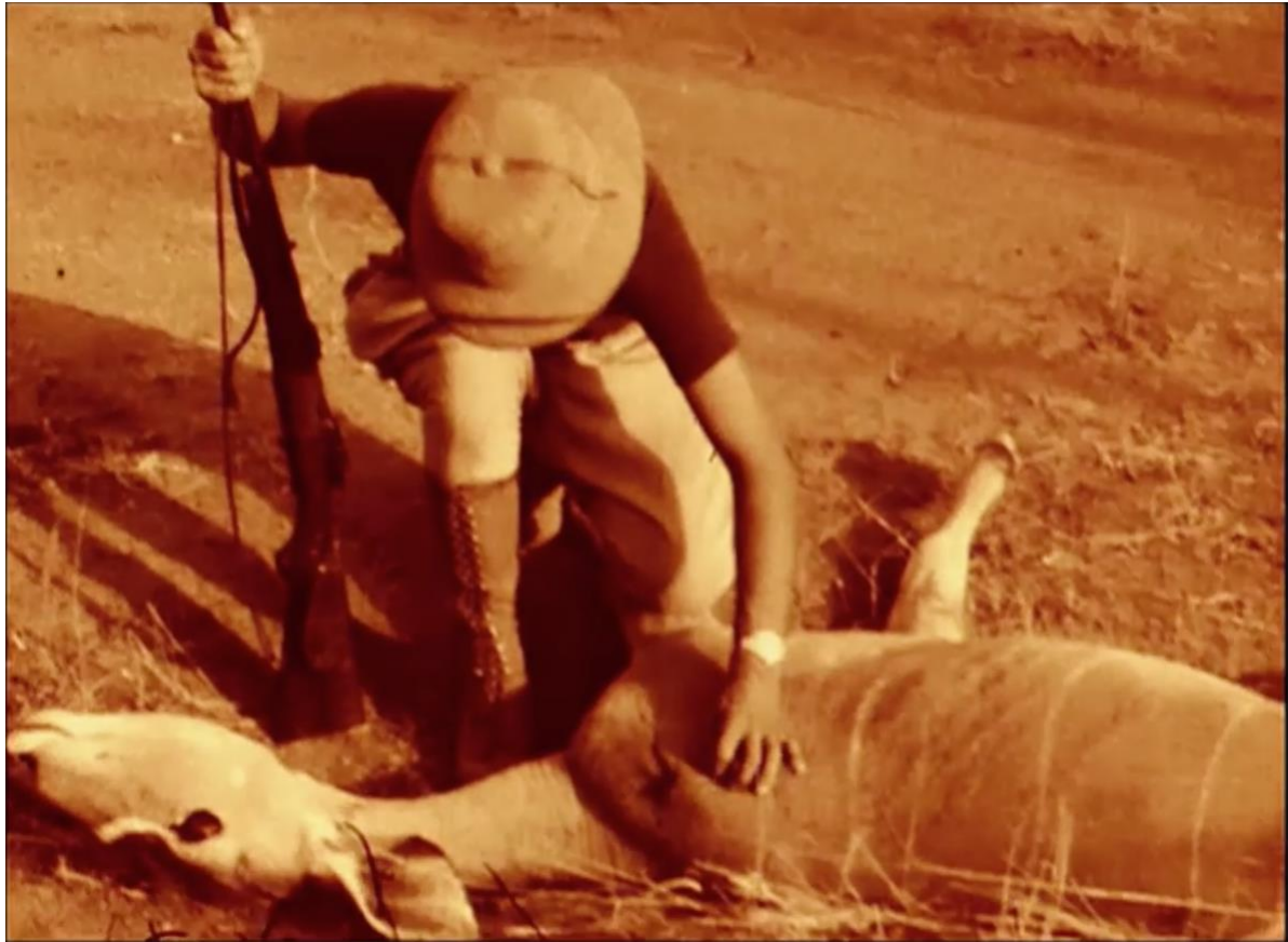
Fig. 7. Yervant Gianikian and Angela Ricci Lucchi, Barbarous Country , 2013, video still © Yervant Gianikian and Angela Ricci Lucchi