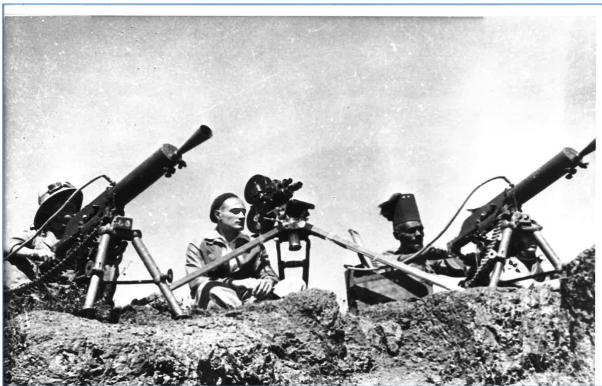
Fig. 1. Lutz Becker, The Lion of Judah (1981), film-still © Lutz Becker