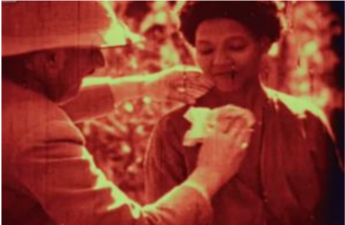
Fig. 6. Yervant Gianikian and Angela Ricci Lucchi, Barbarous Country, 2013, film still