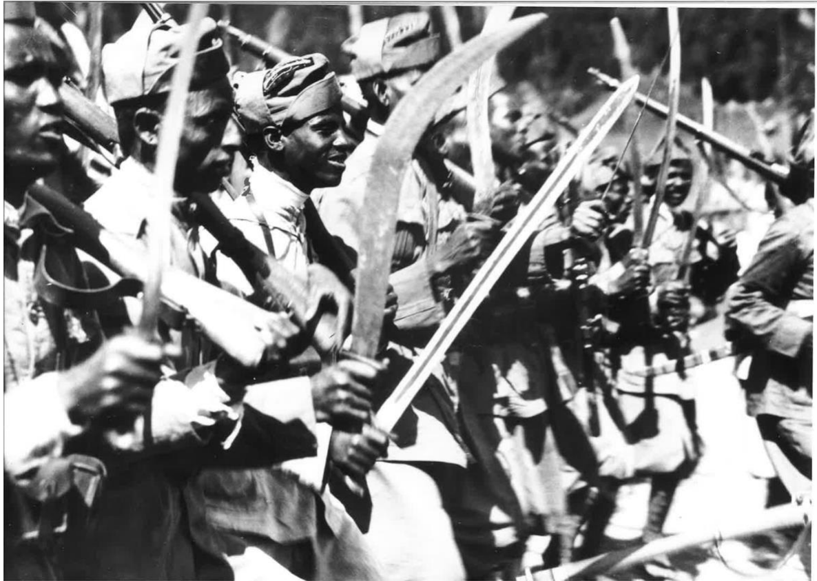
Fig. 2. Lutz Becker, The Lion of Judah (1981), film-still © Lutz Becker