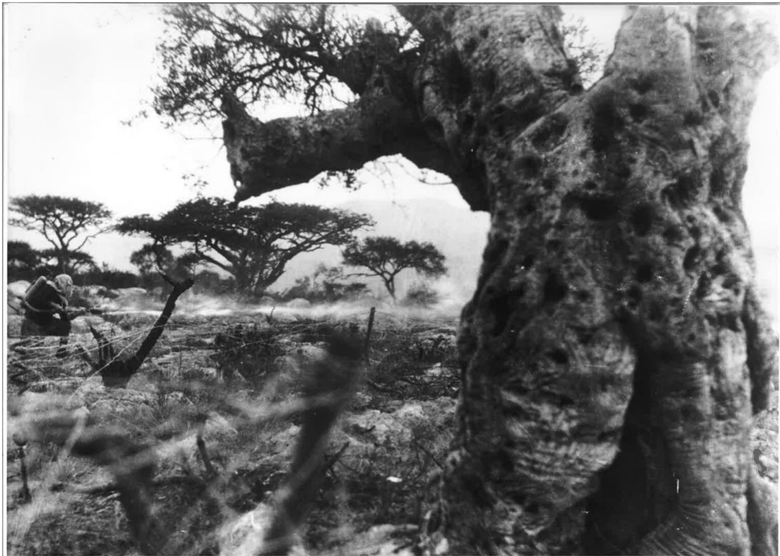
Fig. 4. Lutz Becker, The Lion of Judah (1981), film-still © Lutz Becker