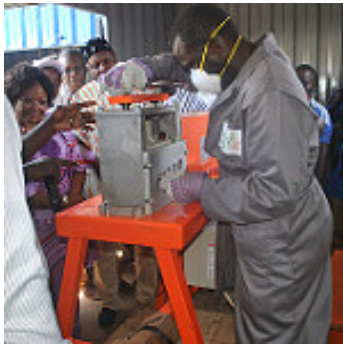
Fig/13. AMP CNC tooling prototype, 2014