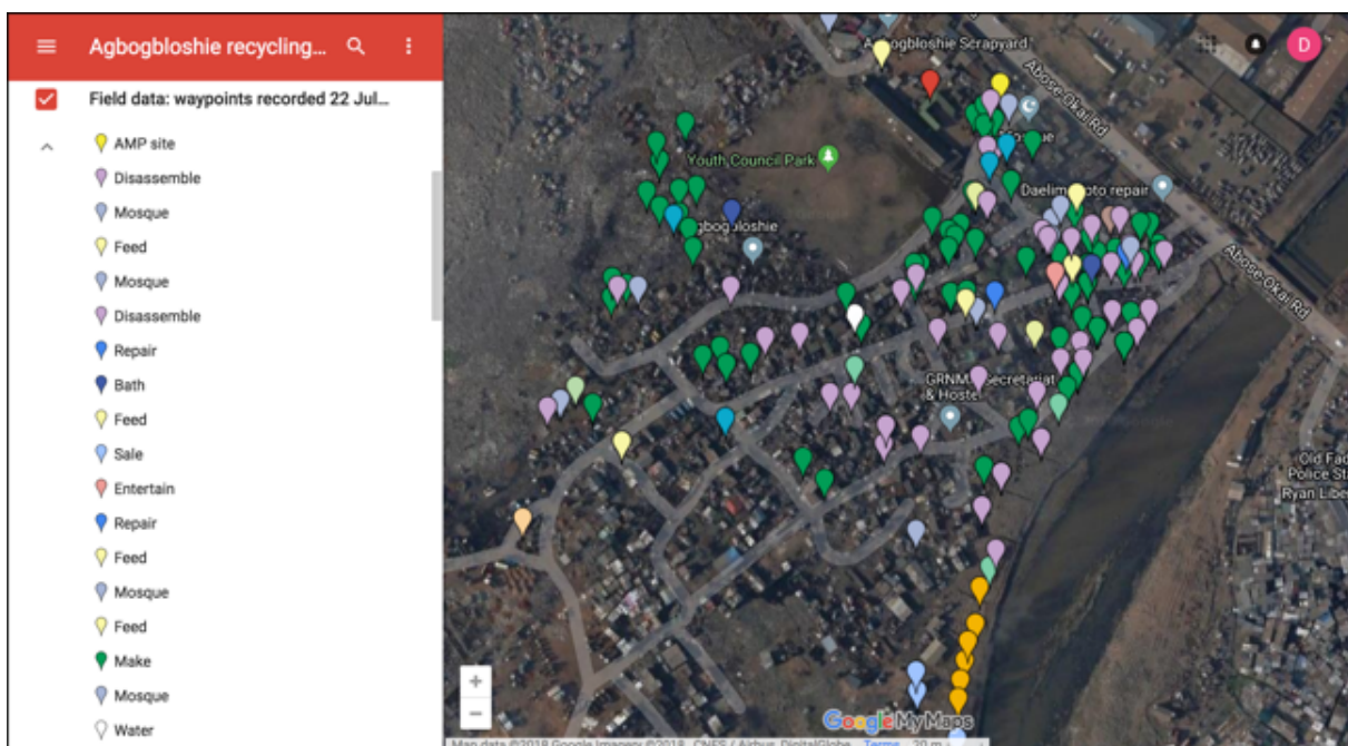
Fig.8. DK Osseo-Asare and Yasmine Abbas, Agbogbloshie recycling and maker ecosystem - fieldwork documentation, 2014

From this, we were able to recognise that making is a spectrum, which goes from unmaking and remaking to making anew. We worked with makers to spatially map the work areas to understand where different activities happen - where workshops are located, where disassembly takes place, where scrap is stored... We collected data (Fig.8) about the waste stream and modelled these flows all the way from the import of products, their reuse, their recycling and ultimately to their export (Osseo-Asare, personal communication, 2018).