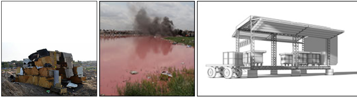
Figs. 1 - 2. DK Osseo-Asare and Yasmine Abbas, Agbogbloshie site - fieldwork documentation, 2014 Fig.3. DK Osseo-Asare and Yasmine Abbas, Agbogbloshie makerspace/workshop design, 2014

planning and construction of solar-powered on-site workshops (Fig.3), skills training regarding the use of machines, establishing new processes for controlling hazardous substances and an information-sharing platform that helps workers distribute materials and working methods. On a conceptual level, it involves mapping out an alternative production and health futures for the district at large, in collaboration with workers and residents.