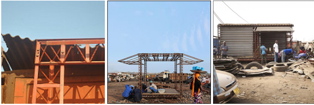
Figs.10 - 12. Agbogbloshie Makerspace Platform in situ construction, 2014