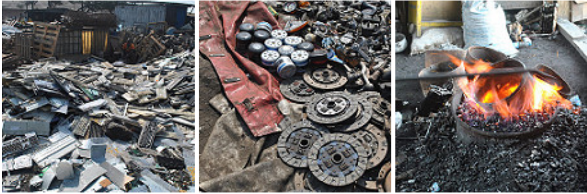
Figs.5 - 7. DK Osseo-Asare and Yasmine Abbas, scrap organisation and metal smelting activities - fieldwork documentation, 2014