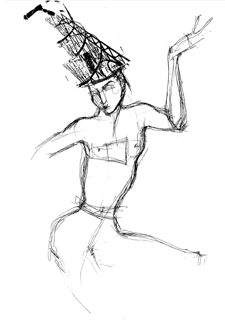
Figure 3: Design sketch for the TatlinTower Headdress © 2012 Michèle Danjoux.

traverses the line to the virtual realm; without seeing the sun or looking at it, her gestures perform a kinesthetic dialogue with an object she can feel and hear. For the time being is filled with these strange ambiguities, and this extends to performance with costume design.