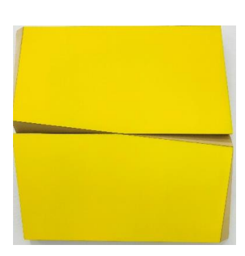
Sean Shanahan, Untitled 2018