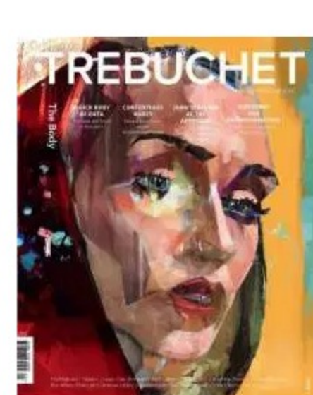
04: The Body