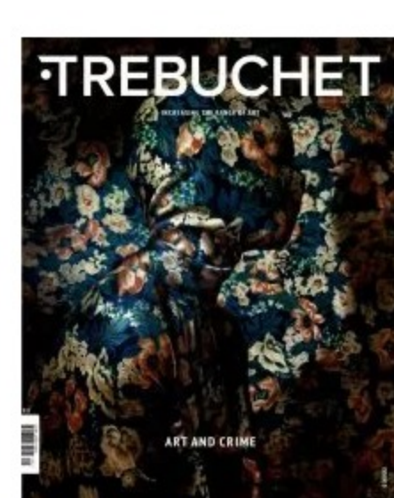
05: Art and Crime