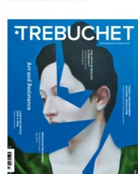
03: Art and Resistance