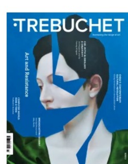
03: Art and Resistance