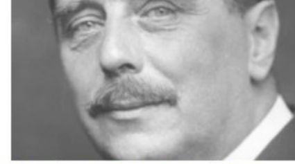
Saw it Coming. Futurism, Vorticism and the Presence of H.G. Wells 17/06/2016 In "Features"