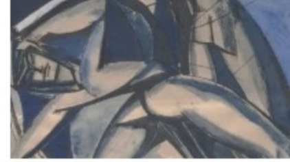
Escaping the Vortex: Would Wyndham Lewis Have Approved? 23/12/2016 In "Art"