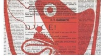
Friends as Enemies and Enemies as Friends... (Wyndham Lewis) 21/11/2016 In "Art"

Read previous essays in this series: Part One | Part Two | Part Three | Part Four | Part Five