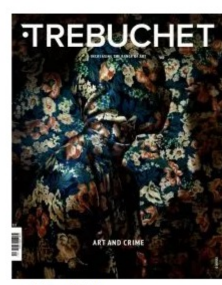
05: Art and Crime