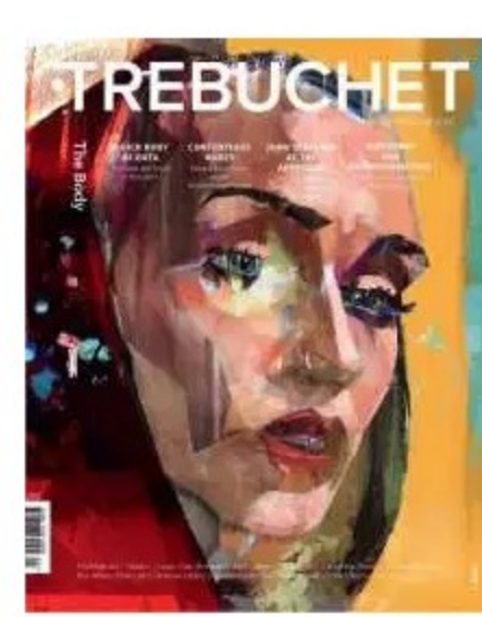
04: The Body