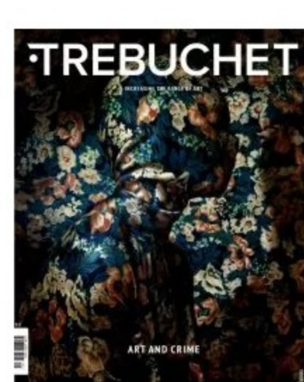
05: Art and Crime