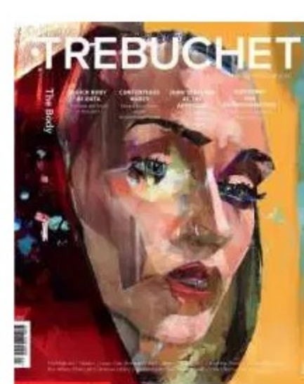
04: The Body