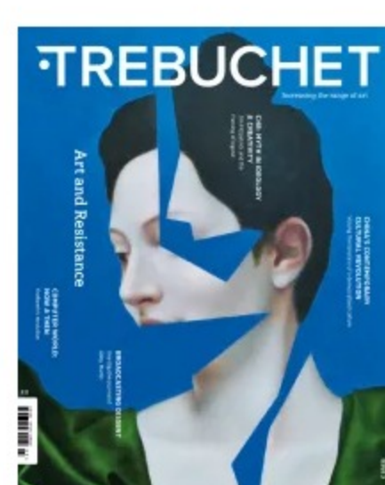
03: Art and Resistance