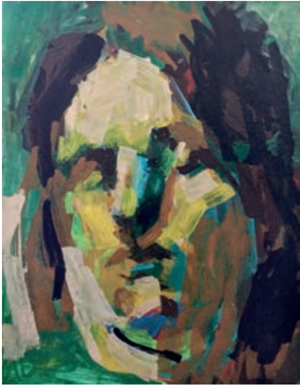
J Sleeping, 2019