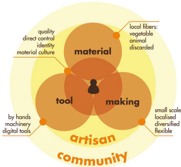
Figure 1: Human-centred framework of artisanship.

communities are bottom-up aggregations rooted in a territory, sharing material cultural background, and co-evolving in line with artisans' needs (Bettiol and Micelli 2014). By using local resources and aesthetic references, textile artisans' communities portray in their fabrics and garments socio-cultural traditions, representative of a particular region and passed down from generation to generation.