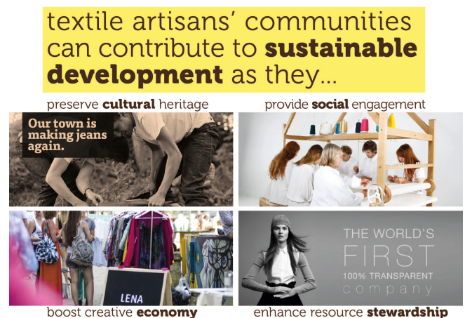
Figure 2: Holistic contribution of textile artisans' communities to sustainable development.

In order to tackle the unsustainable development of globalised mass-produced garments, cutting-edge design approaches (towards flexible and redistributed manufacturing, circular and sharing economies, grassroots service innovations) are being explored. Ultimately, to achieve holistic sustainability, it is required to live responsibly in terms of environmental issues, social justice and economic equity (Bhamra and Lofthouse 2007). Textile artisanship can contribute to sustainable development, as it could potentially preserve cultural heritage, provide social employment, boost creative economies and enhance environmental stewardship (Figure 2).