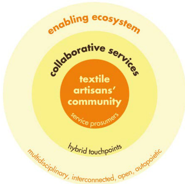
Figure 4: Contribution of service design to textile artisans' communities.

paradigm of competition in favour of peer-to-peer relationships, inspired by co-sustainability within natural systems (i.e. biomimicry), which co-evolve without affecting each other. The proposed service design model is expected to give birth to new forms of active communities, triggering new ideas of locality and a stronger sense of belonging and social responsibility (Figure 4).