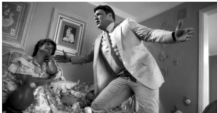
True Stories (March 25)