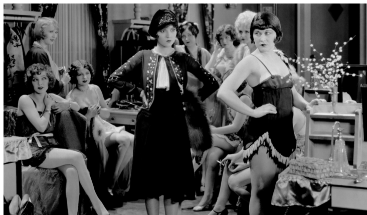
Fig Leaves (March 18)

Total running time: 110 mins. Video unless noted. Women's shoes trigger amorous behavior and sexual fixations that can cause a breakdown in social etiquette. These films explore various routines of wearing and showing off shoes for the camera, focusing on notions of exhibition, voyeurism, and lust. In the Buñuel film, Jeanne Moreau is a maid at a country estate whose eccentric inhabitants include a boot fetishist.