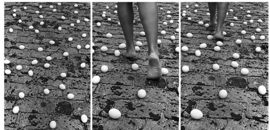
Film stills from In-Out (Antropofagia) /[ In-Out (Antropofagia) ] 1973-4 / © the artist