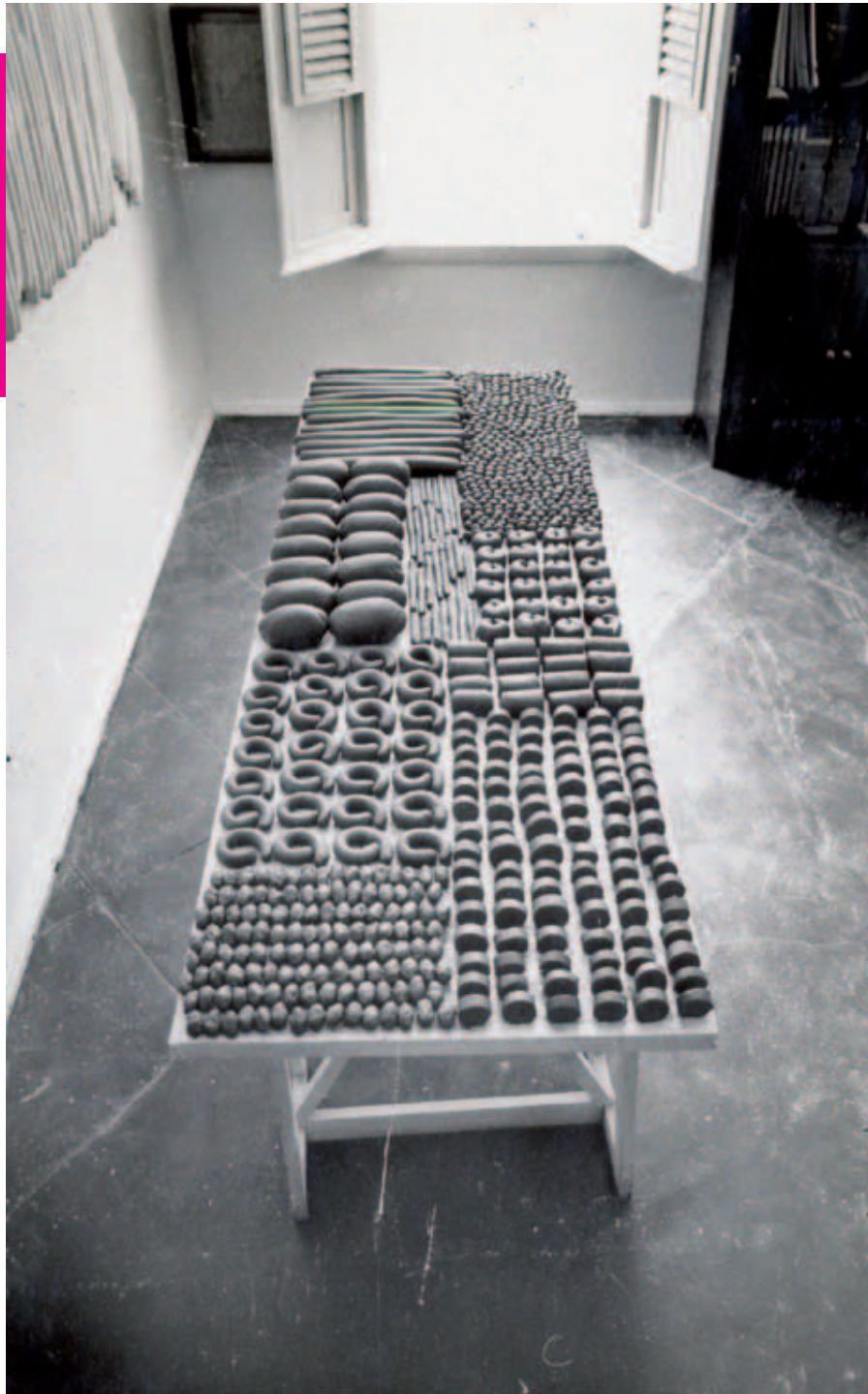
Study for installation , studio view, Rio de Janeiro, 1994