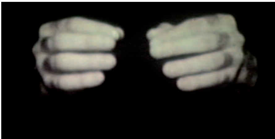
Film still from Ad Hoc (For This Case) 1982

‘Repetition changes nothing in the object repeated, but does change something in the mind which contemplates it.’ — David Hume