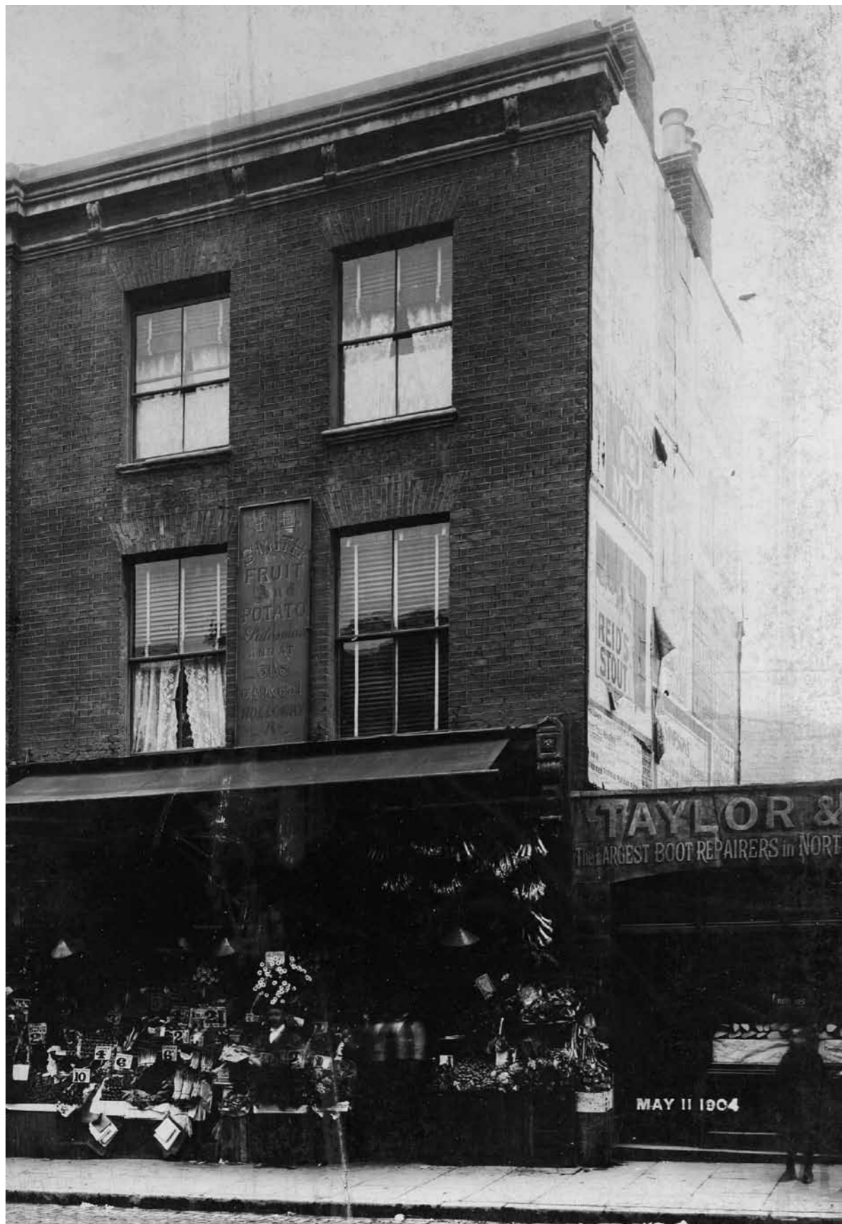
Ernest Milner No 2 Junction Road (present address of Archway Tower) 1904