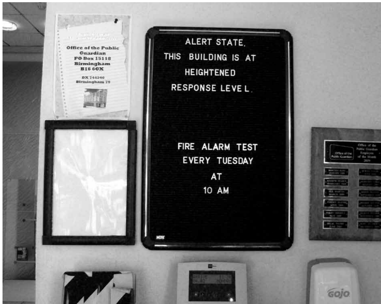
A Heightened Response Level Archway Tower, Conall McAteer 2012