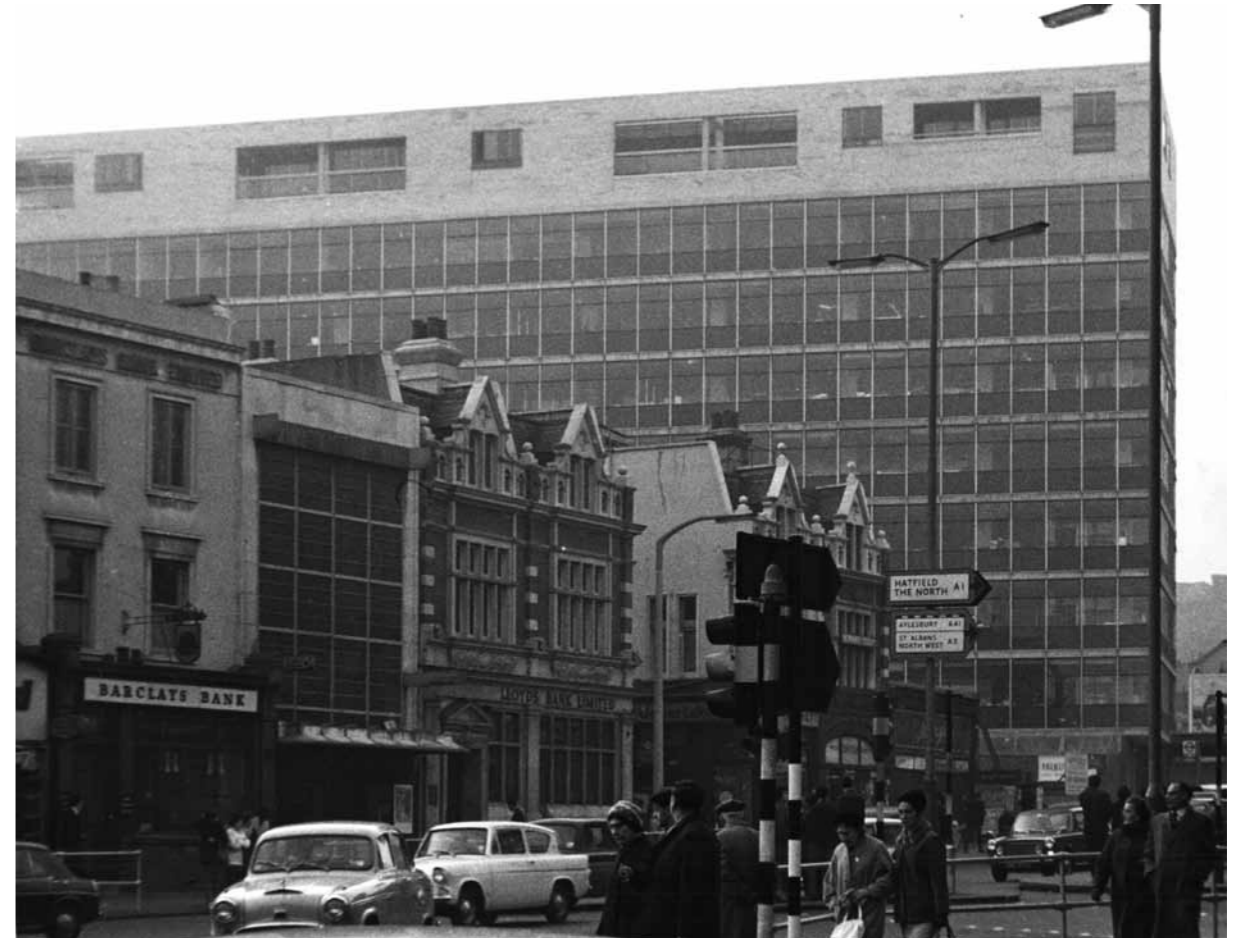
Photographer unknown 7 – 15 Highgate Hill, before Archway Tower 1964 Courtesy Islington Local History Centre