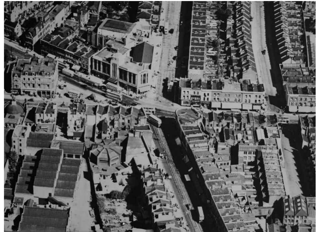
Unknown Photographer Aerial View of Archway 1934 Courtesy Archway Methodist Church