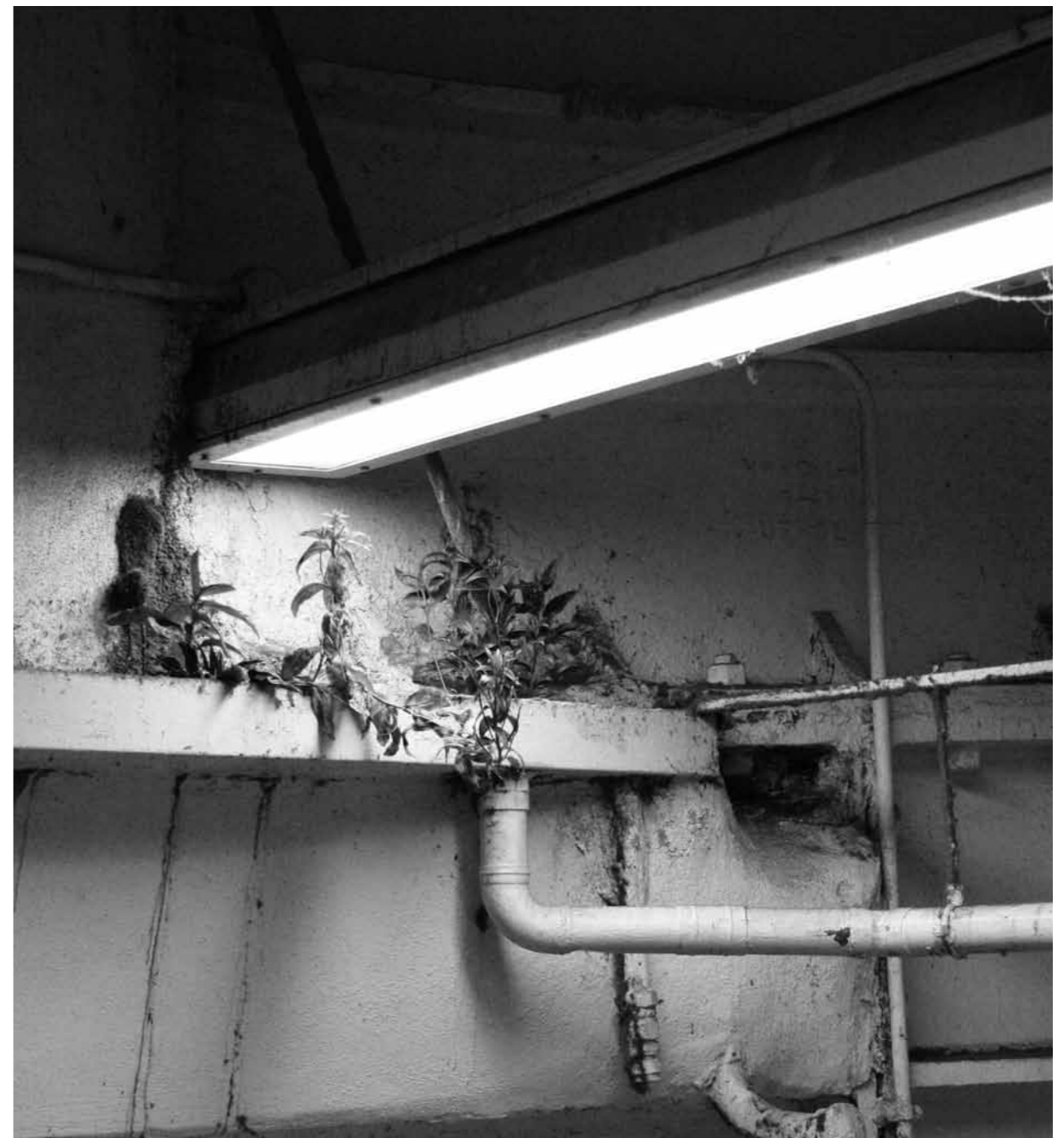
AIR Archive Plants beneath Archway Tower 2012