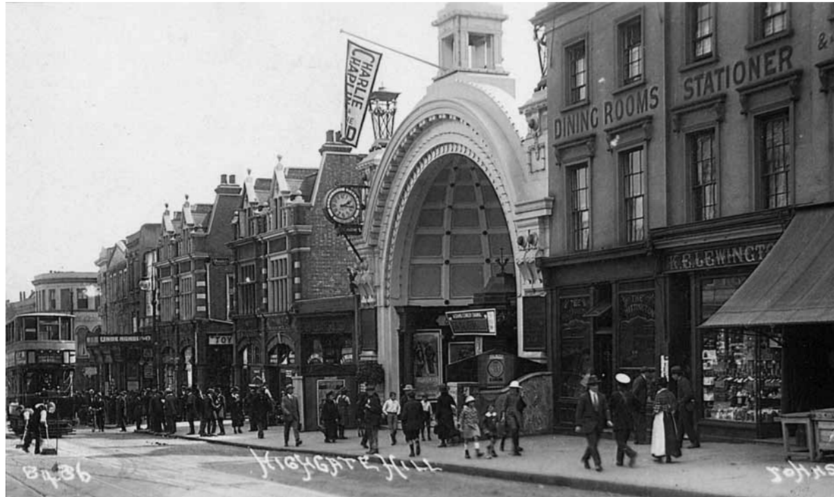
The Electric Palace, Highgate Hill 1922