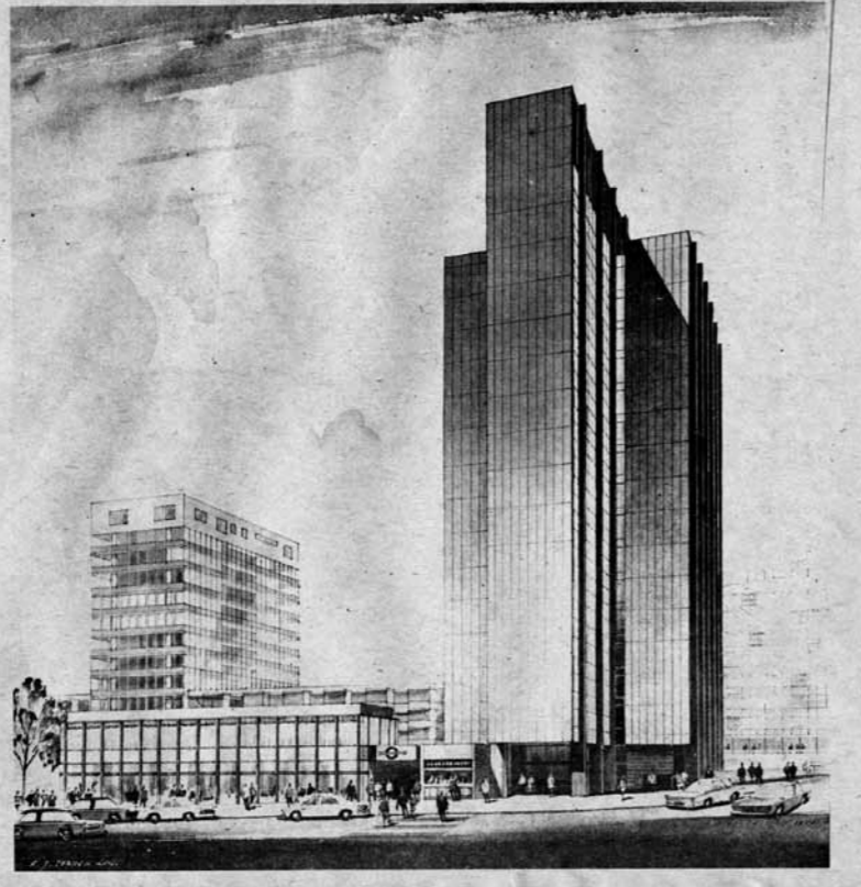
Archway's face of the future Islington Gazette 1972

With the Archway Road widening already underway, the rebuilding of Whittington Hospital set and major housing developments being undertaken nearby by Islington Council in the Girdlestone Road area and by the Greater London Council in the Elthorne Road area, the Archway area will soon be barely recognisable.