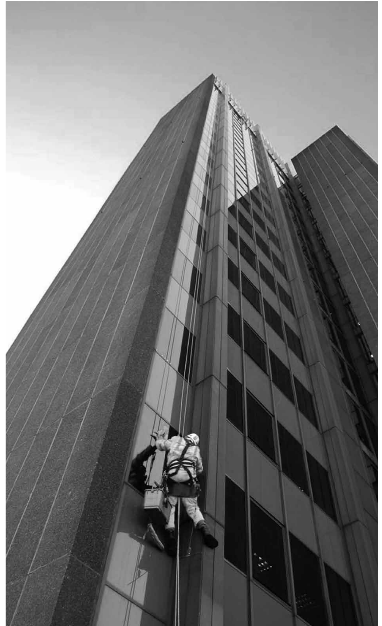
Xavier Llarch Font Abselling window cleaners 2011

I've never been inside Archway Tower. I always looked at it from outside. It was never for me this romantic idea of viewing the city from the tower. Elevating from a particular point of the city, so that you can see the rest of the city, almost being an outsider even if you are inside, you are separated from the ground and looking at it and being able to reflect. Archway Tower was not like that for me, it was more like a magnet.