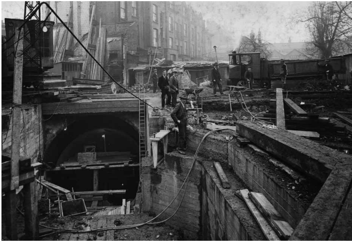
Topical Press 1930 Reconstruction of Highgate (now Archway) tube station © Transport for London, courtesy The London Transport Museum