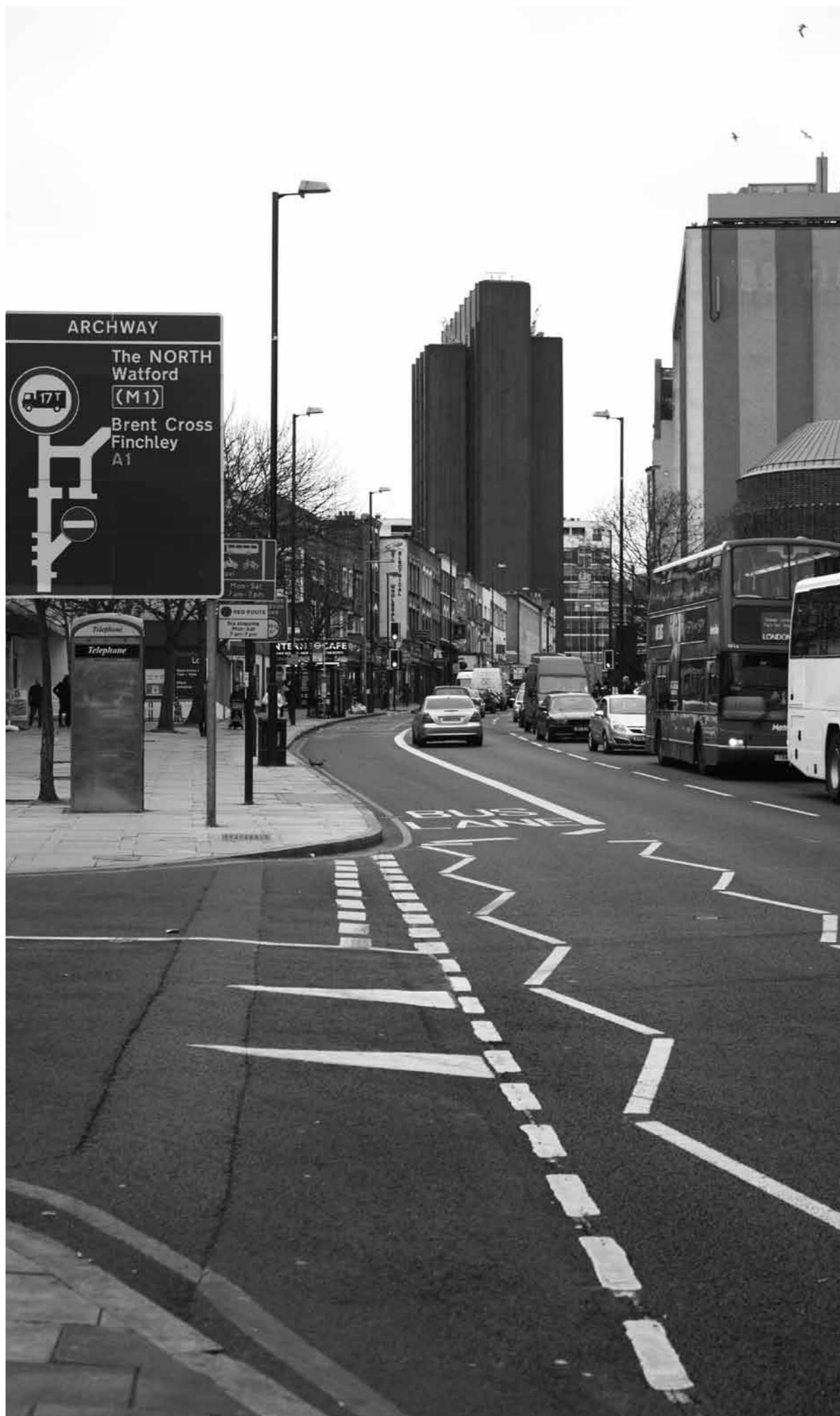
AIR Archive Archway Tower 2012