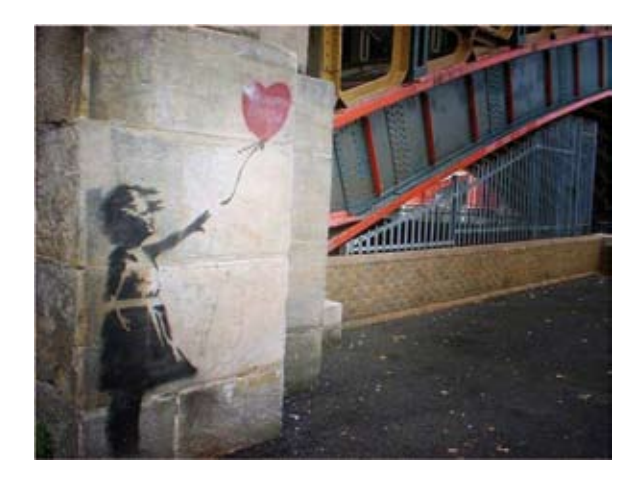
South Bank 2, London