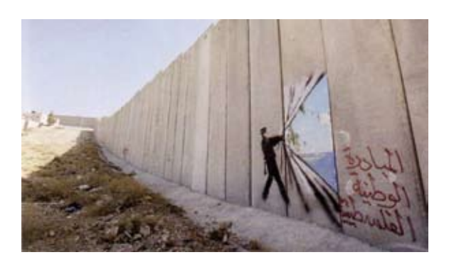
Wall and Peace, 2005

Until recent years Banksy had no gallery or representation. Initially operating from the early 1990s as a free-hand street graffiti artist, then increasingly using stencils to facilitate the swifter execution of work – and avoidance of detection and arrest for criminal damage or trespass to other people's property. He was an urban guerrilla artist, using the built environment as both his canvas and his gallery to convey messages to the general public against war and capitalism and the establishment with images and often with text. He had no objects for sale.