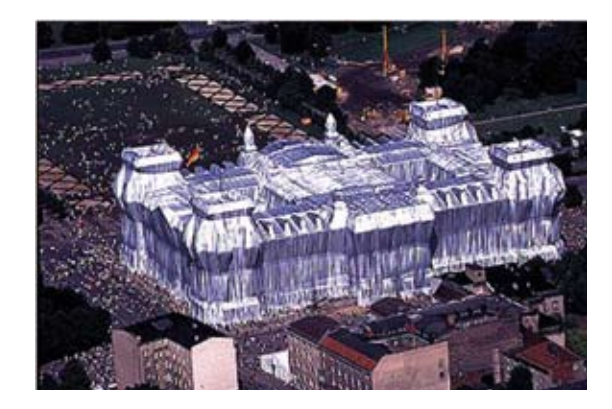
Wrapped Reichstag, Berlin 1971–1995