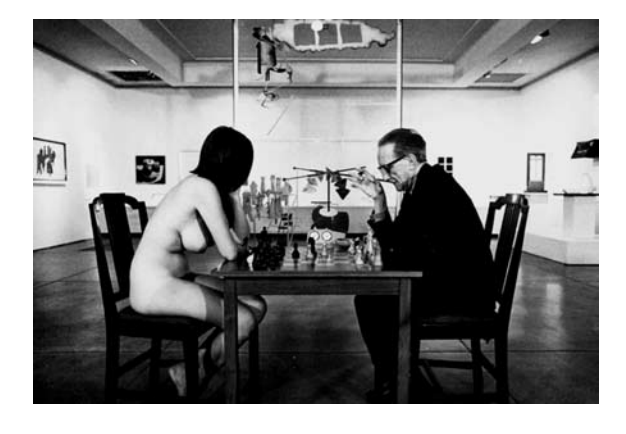
Marcel Duchamp & Eve Babitz, Pasadena Art Museum, Duchamp Retrospective, 1963

Extract from Marcel Duchamp's lecture on The Creative Act at The American Federation of Arts, Houston, Texas, April 1957