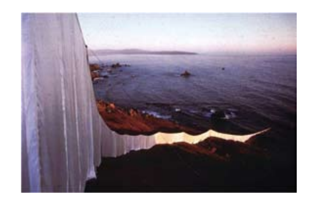
Running Fence, 1972–76

When Christo set out to erect a fabric fence across twentyfour miles of California ranch land, he encountered massive resistance from landowners and bureaucrats alike, in addition