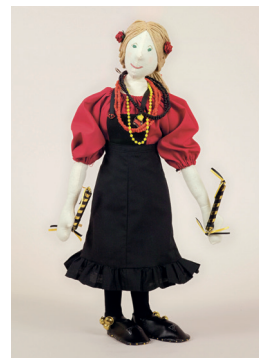
Severn Gilders Morris Figure 2014. Fabric, glass beads, metal, wood and leather.