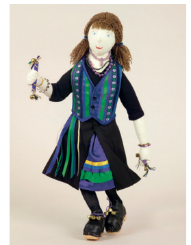
Mortimer's Morris 2014. Fabric, glass beads, metal and leather.