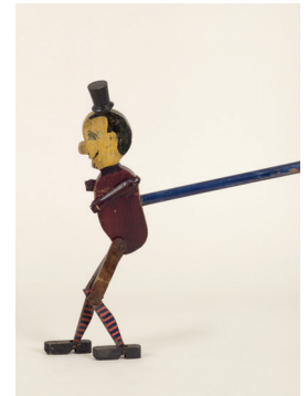
Mr Jolly Boy Jig Doll Early 20 th century. Wood and metal. Maker unknown.