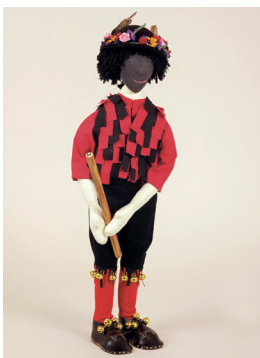
Iron Men Morris 2014. Fabric, glass beads, metal, wood and leather.