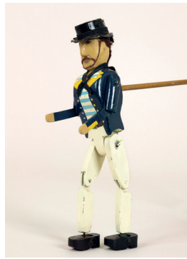
Jolly Jack Tar 1980's. Wood, card and fabric. Maker unknown.