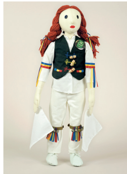
Mad Jacks Morris figure 2009. Wood, fabric and fibre.