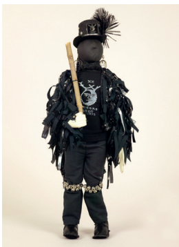
Hunters Moon Morris figure 2009. Fabric, metal, feature and wood.