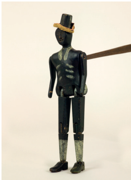
Skeleton Dancer Late 19 th century. Wood and card. Maker unknown.