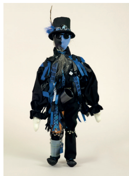
Bakanalia Morris Figure 2014. Fabric, metal, plastic and human hair.