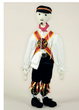
Sompting Morris Figure Fabric, wool and metal.