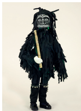
Wild Hunt Bedlam Morris 2014. Fabric, paper mache, metal, wood and leather.