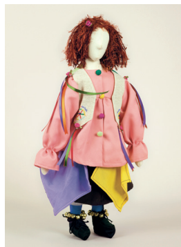
Cogs & Wheels Ladies Morris 2014. Fabric, wool and metal.