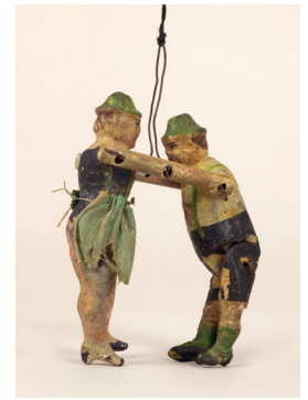
Dancing couple Early 20 th century. Wood. Maker unknown.