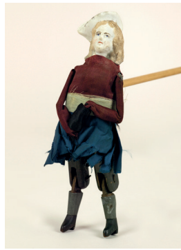
Mouse Lady Late 19 th century. Wooden figure with china head and fabric clothes. Maker unknown.