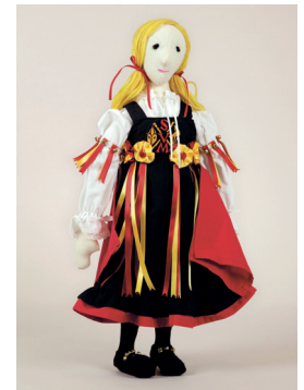
Sompting Morris Figure Fabric, wool and metal.