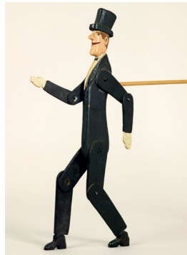
Dapper Dan 1970's. Wood. Maker unknown.