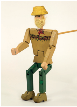
Farmer Giles 1980's. Wood, Fabric, Fibre. Maker unknown.