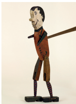
Mr Jolly Boy Jig Doll Early 20 th century. Wood and metal. Maker unknown.