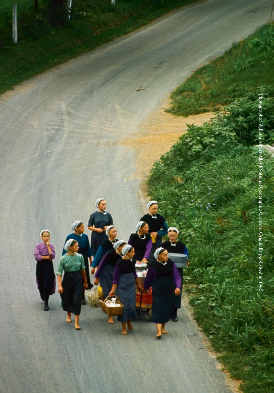
Originally published in 1965.