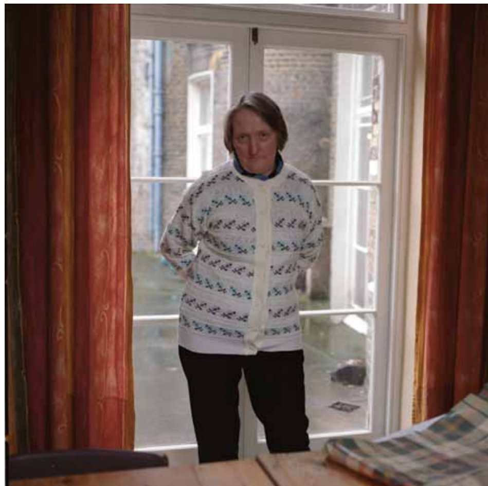
Lots of people just don't know what poverty means, what it's like or what it's all about. They just don't know.