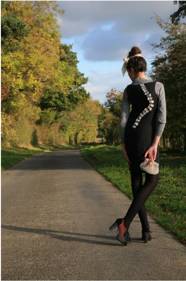
Image 2: Another image from ‘Twisted Embrace: In homage to the late Alexander McQueen.’