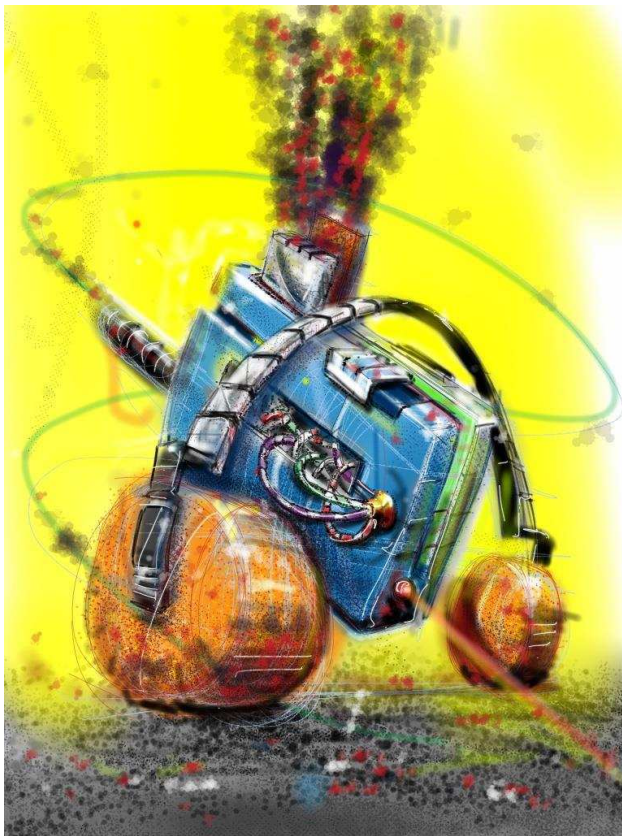
FIGURE 2. ROBOT DRAWN USING AN IPAD

For eighteen months Firth has been working with an iPad and has recorded how it has affected his sketchbook activity. As a compulsive drawer he quickly mastered the drawing applications on the iPad favouring Sketchbook Pro because the interface was the most intuitive and the iconography was similar to other professional design software compared to the competition. While we were on a long train journey I watched him doodle and sketch up fantasy designs for futuristic robots (see figure 2). He was enjoying the freedom and elasticity of sampling textures and patterns from photographic media that could be employed as brush textures in his digital drawings. Carried by the novelty of a new toy he persevered with learning the new digital tools and developed his own short cuts and