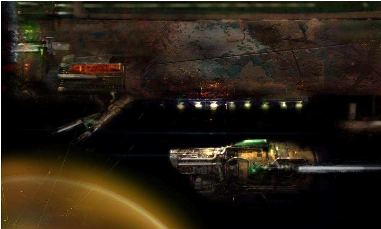
FIGURE 4. WORKED UP SKETCH USING IPAD.

In the last six months his attitude to the iPad has changed. “I haven’t used the drawing application on iPad for awhile, I’ve forgotten half the shortcuts, sequences that made the thing fluid” (Firth interview). Many of his designs for the digital games originated in sketchbooks and then digitally captured to be worked up using Adobe software (see figure 3 and 4). The screen began to represent “work”, and the paper sketchbook was “relaxation”, therapeutic, “time out to reflect, like a roll-up cigarette, a meander”. As a starting point for creative thought the physical sketchbook could always be relied upon. For solving problems visually a sketchbook is direct and immediate, from mind to paper. As a teaching tool the paper sketchbook remains indispensable.