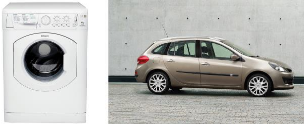
Figure 1. Domestic Appliance [left] (Hotpoint WML520P, n.d.); Car [right] (netcarshow.com, 2008).

Female, age 39. Married with two children aged 3 and 8 months. Lives in Hertfordshire. The two product choices are low interest items in her life.