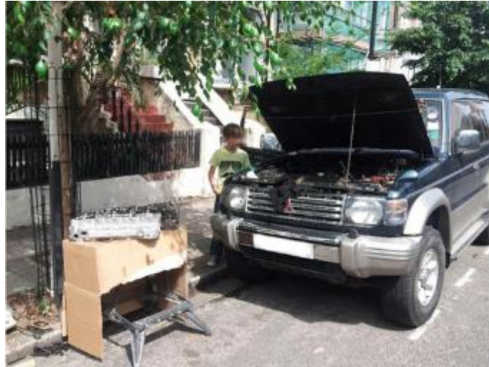
Figure 4. Car

Male, age 52. Married with two children aged 12 and 15. Lives in London. Is an inveterate fixer of things.