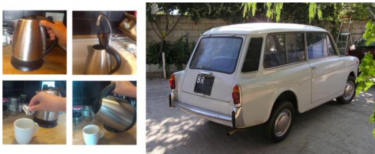
Figure 3. Domestic Appliance [left]; Car [right]