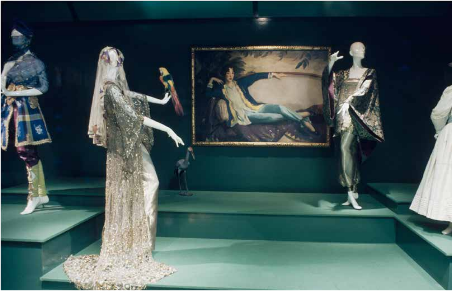
BELOW American Women of Style. The Metropolitan Museum of Art, New York, USA, December 1975–September 1976. Curated by Diana Vreeland and Stella Blum.

A Century of Flowered Waistcoats Platt Hall, Manchester, England, 1976–March 1977