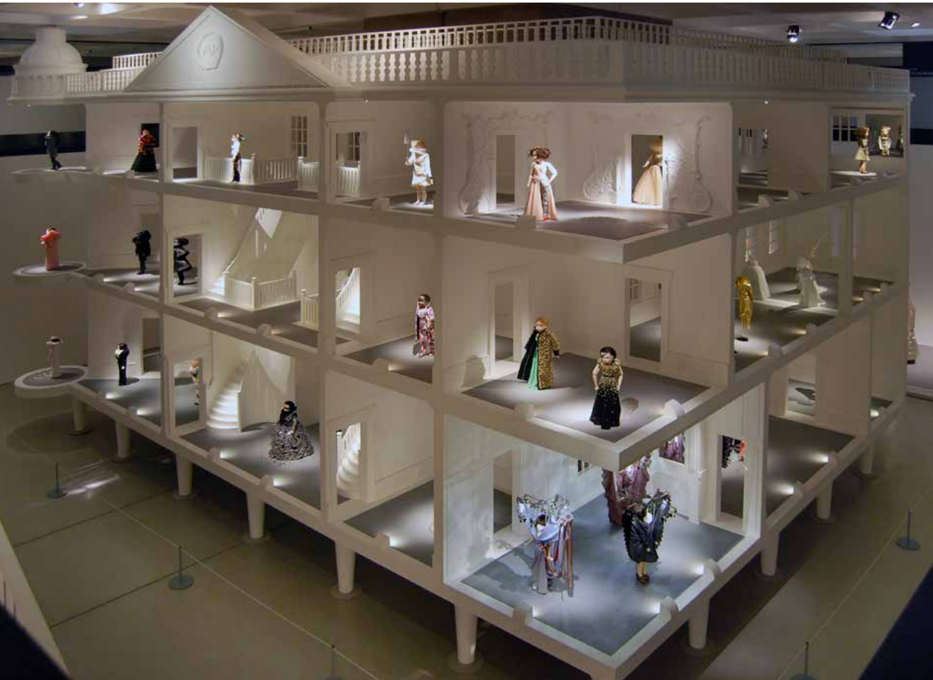
BELOW The House of Viktor & Rolf. Barbican Art Gallery, London, England, 18 June–21 September 2008. Curated by Jane Alison, designed by Siebe Tettero.