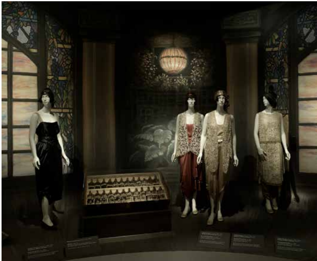
OPPOSITE Stephen Jones & The Accent of Fashion. ModeMuseum, Antwerp, Belgium, 8 September 2010-13 February 2011. Curated by Geert Bruloot and Kaat Debo, designed by Geert Bruloot.