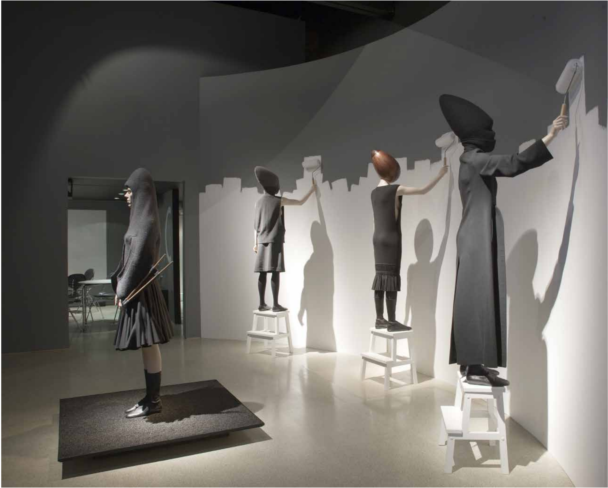
LEFT Hussein Chalayan: From Fashion and Back - Panoramic (Autumn/Winter 1998). Design Museum, London, England, 22 January-17 May 2009. Curated by Donna Loveday and Mark Wilson, designed by Block Architecture.