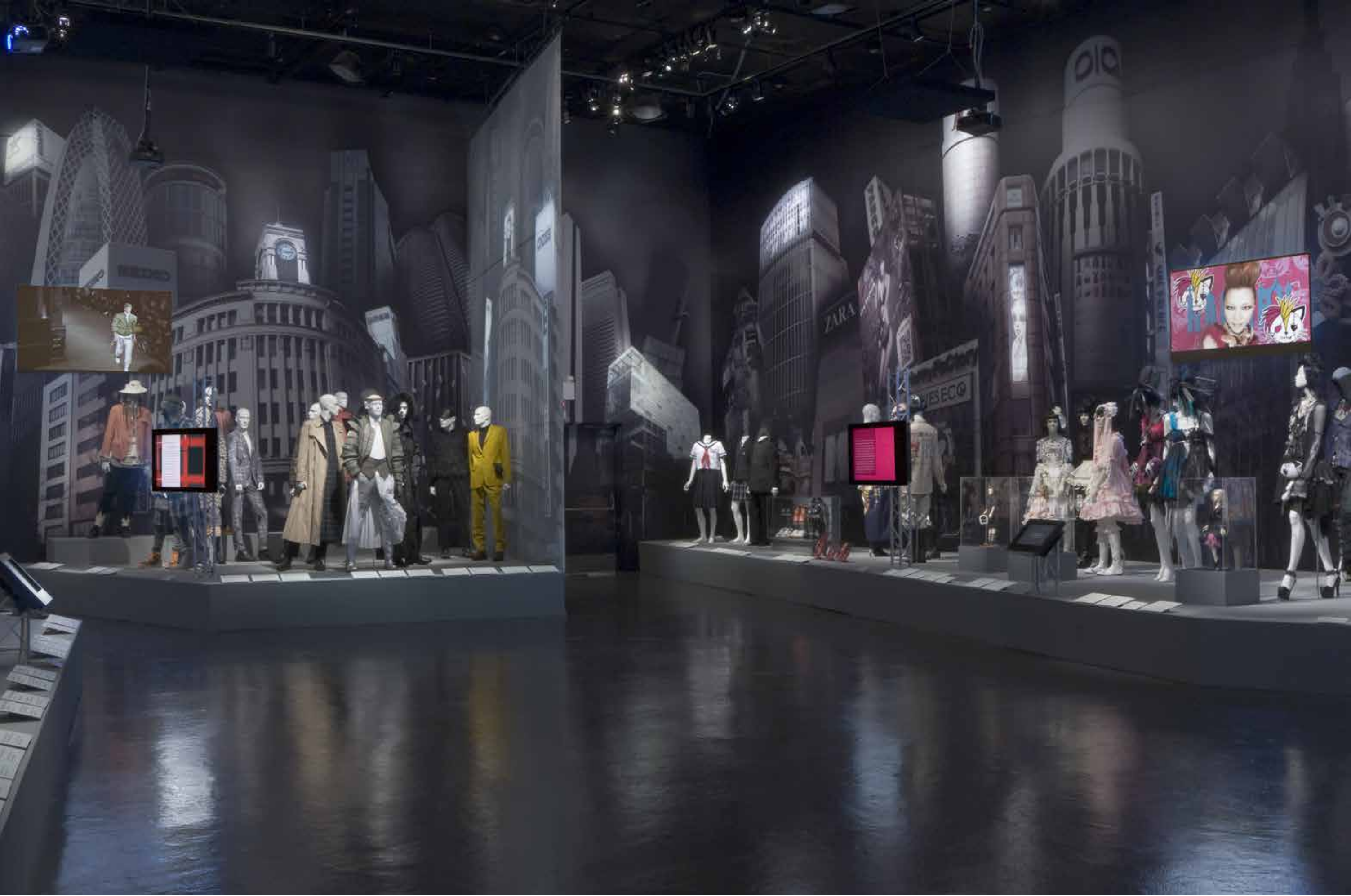
LEFT Japan Fashion Now , The Museum at the Fashion Institute of Technology, New York, USA, 17 September 2010-8 January 2011. Curated by Valerie Steele, designed by Charles B Froom.