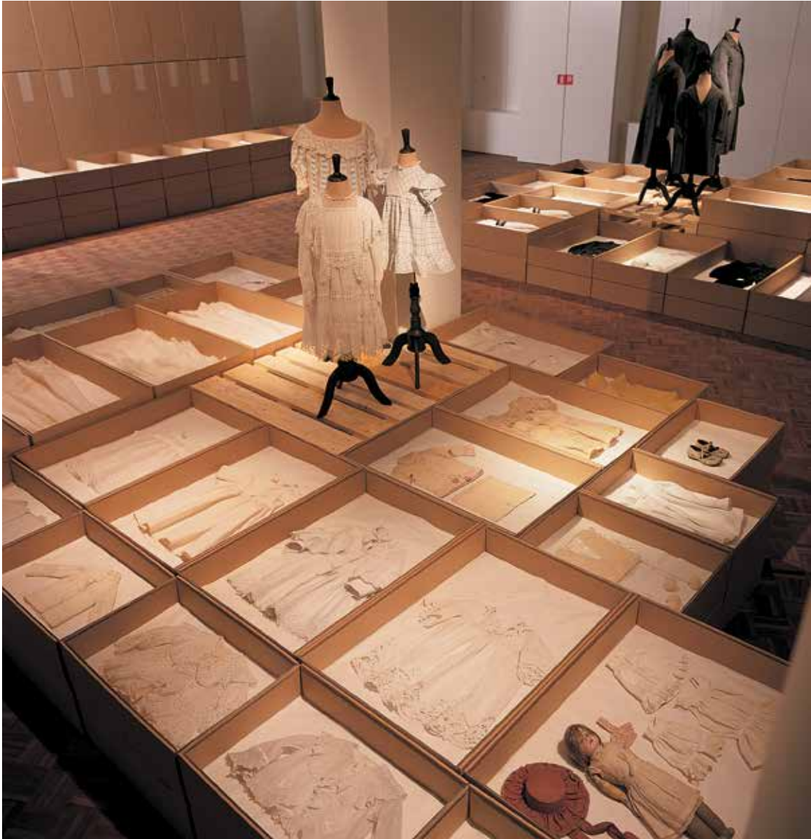
LEFT Backstage: Selection 1. ModeMuseum, Antwerp, Belgium, 21 September 2002-4 April 2003. Curated by Kaat Debo, designed by Bob Verhelst.

The Artistry of Adrian: Hollywood's Celebrated Designer Kent State University Museum, Kent, USA, 5 June-17 November 2002