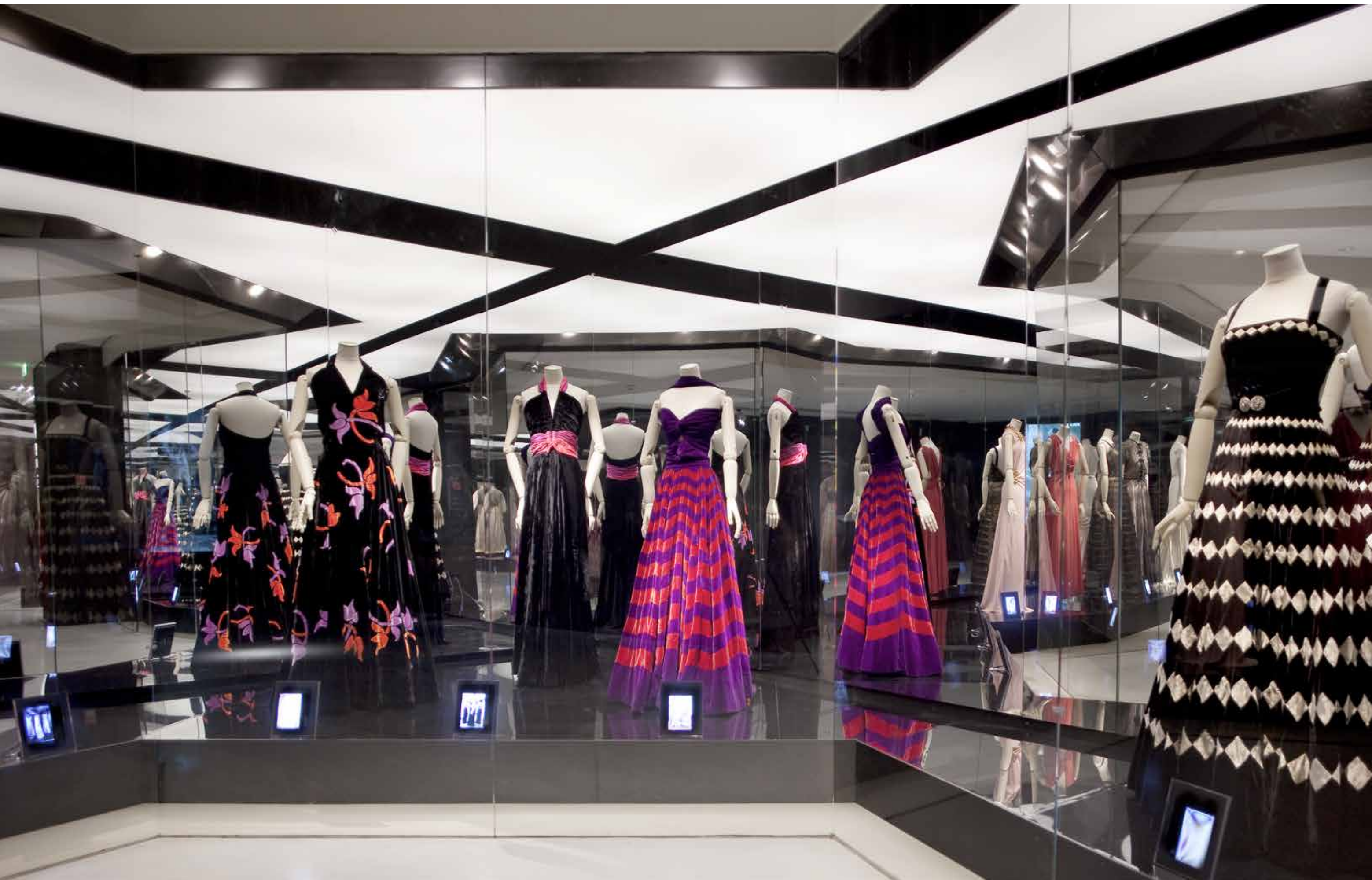
LEFT Madeleine Vionnet: Puriste de la Mode. Les Arts Décoratifs, Paris, France, 24 June 2009–31 January 2010. Curated by Pamela Golbin, designed by Andrée Putman.