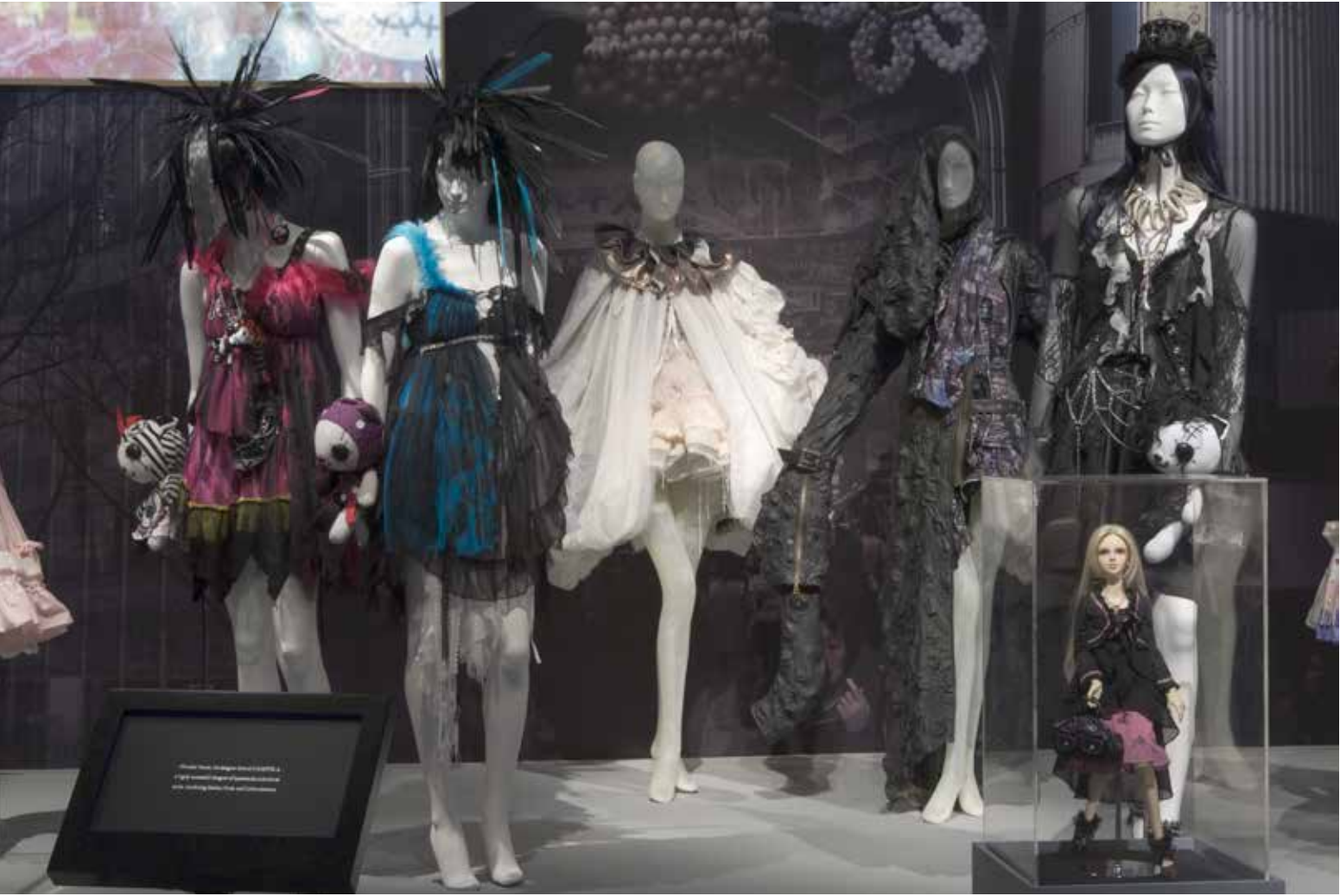
BELOW AND OPPOSITE Japan Fashion Now , The Museum at the Fashion Institute of Technology, New York, USA, 17 September 2010-8 January 2011. Curated by Valerie Steele, designed by Charles B Froom.