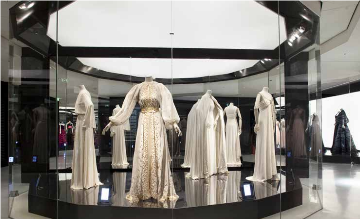
TOP AND ABOVE Madeleine Vionnet: Puriste de la Mode. Les Arts Décoratifs, Paris, France, 24 June 2009–31 January 2010. Curated by Pamela Golbin, designed by Andrée Putman.