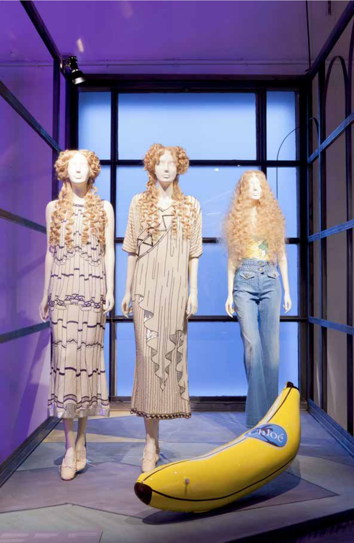
ABOVE Chloé. Attitudes. Palais de Tokyo, Paris, France, 29 September–18 November 2012. Curated and designed by Judith Clark.

Les Arts Décoratifs, Paris, France, 13 December 2012–14 April 2013