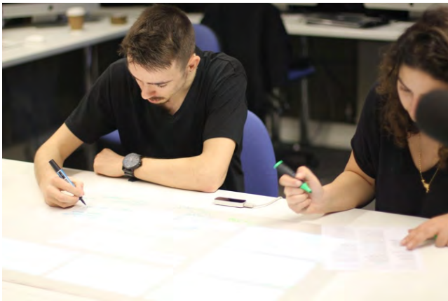
Figure 2. Participants do augmented sketching (wide).