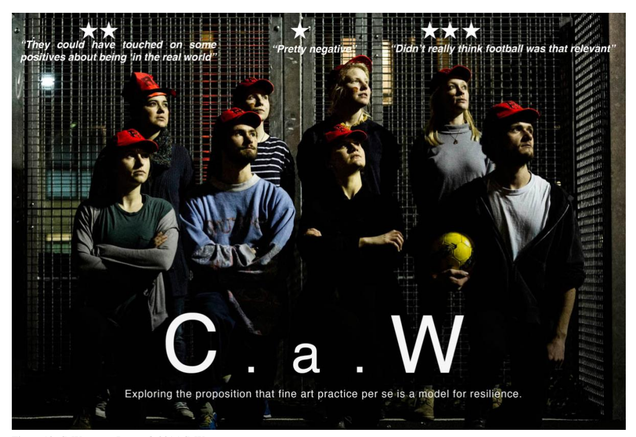
Figure 12. CaW poster. Image © 2015 CaW.