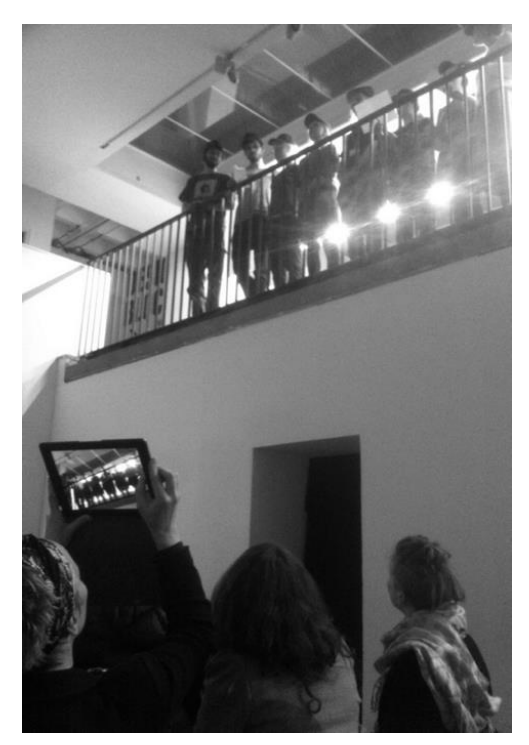
Figures 7 and 8. CaW "Mindfulness Workshop" and performance of "Cover Letter Song" at Cultures of Resilience Exchange, LCC, UAL, March 2015.