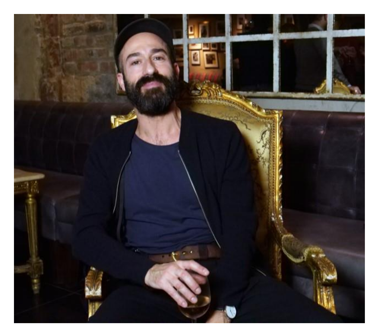
Figure 2. Taking in the Scene (source) Peral 2016