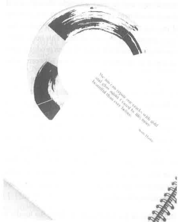
Figure 4 An impression of the books by Van O

In order to investigate how to brand the locality, sustainability and transparency of these locally produced textiles, a collective platform and thinking laboratory Van O was initiated as part of 'Going Eco, Going Dutch'. 11 Instead of a