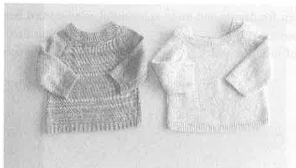
Figure 2 Tous les Chéris

This report also highlights the importance for designers to build close relationships with all actors in the supply chain, especially with the manufacturer: 'seeing first-hand how the factories work, what their conditions are like and the people behind the products is key to knowing that you are acting in a fair, respectful way' (De Brouwer, 2017: 24). The close relationship between designer and manufacturer has greatly affected the creative process of the designers of Tous les Chéris (a local Dutch baby clothes brand) and Moyzo (a local Dutch fair trade fashion label). The creative designers of these local brands used the yarns made from hemp and recycled denim to weave cloth and knit fashionable textiles. In addition, they worked according to the design for recycling principles. For example, Moyzo designed a prototype wrap top from yarn that consists of hemp and viscose. All prototypes are made to be easily recycled. Tous les Chéris also experimented with the yarns to knit and/or weave cloth for prototypes of baby clothes.