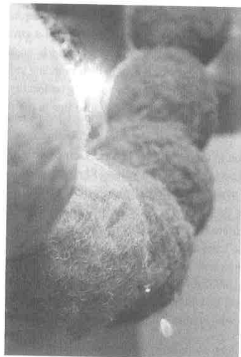
Figure 5 Chain of beads by IoSphere