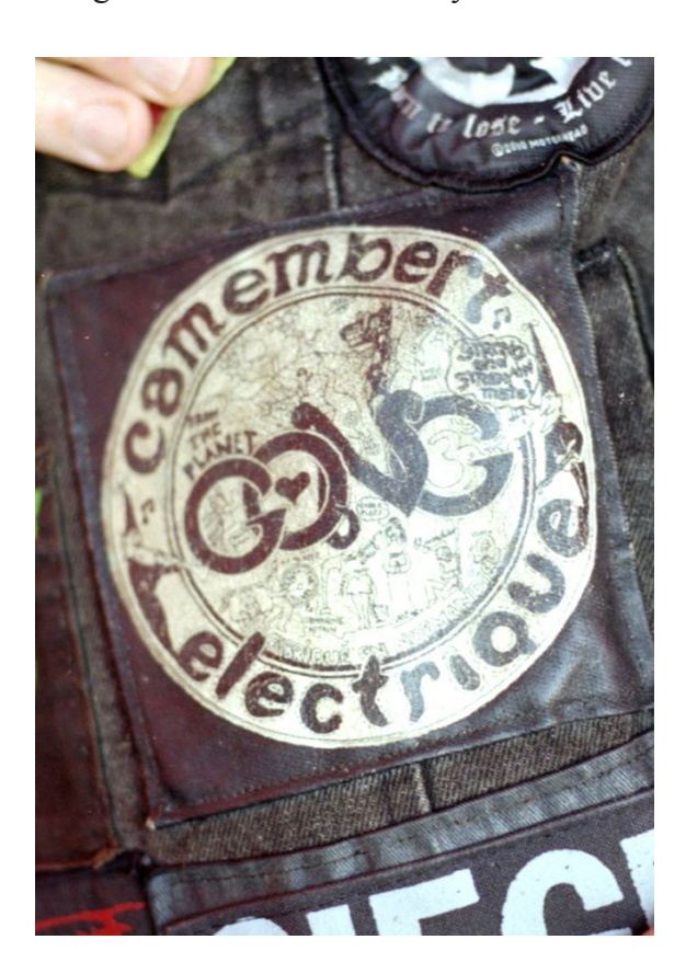
Detail of Pete's hand painted Gong patch