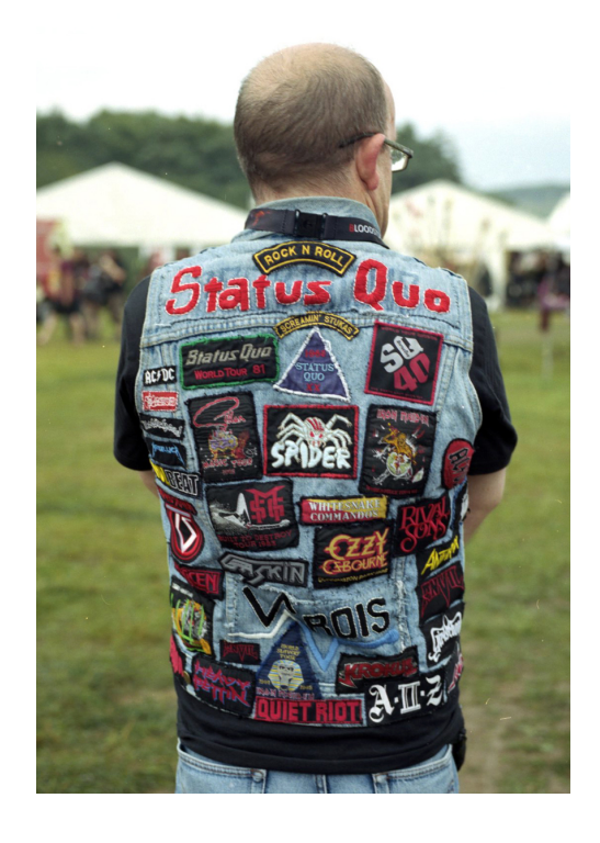
Examples of hand embroidered jackets, Bloodstock Festival, UK, August 2014