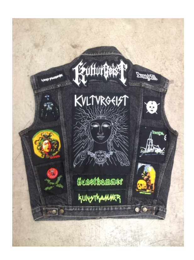
Tom Helyar-Cardwell Aiden's Jacket Front , watercolour on paper, 38 x 26 cms, 2014