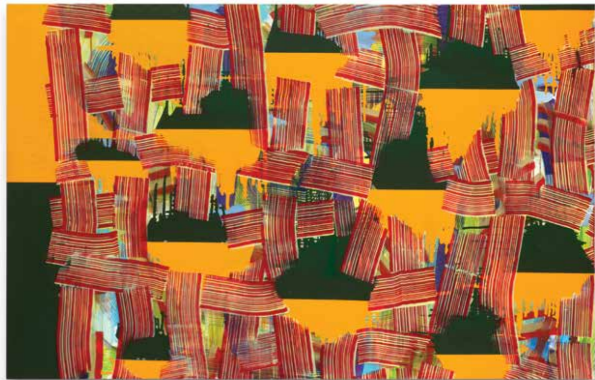
Fire and Fleet 2008 Acrylic on canvas 213 × 335 cm