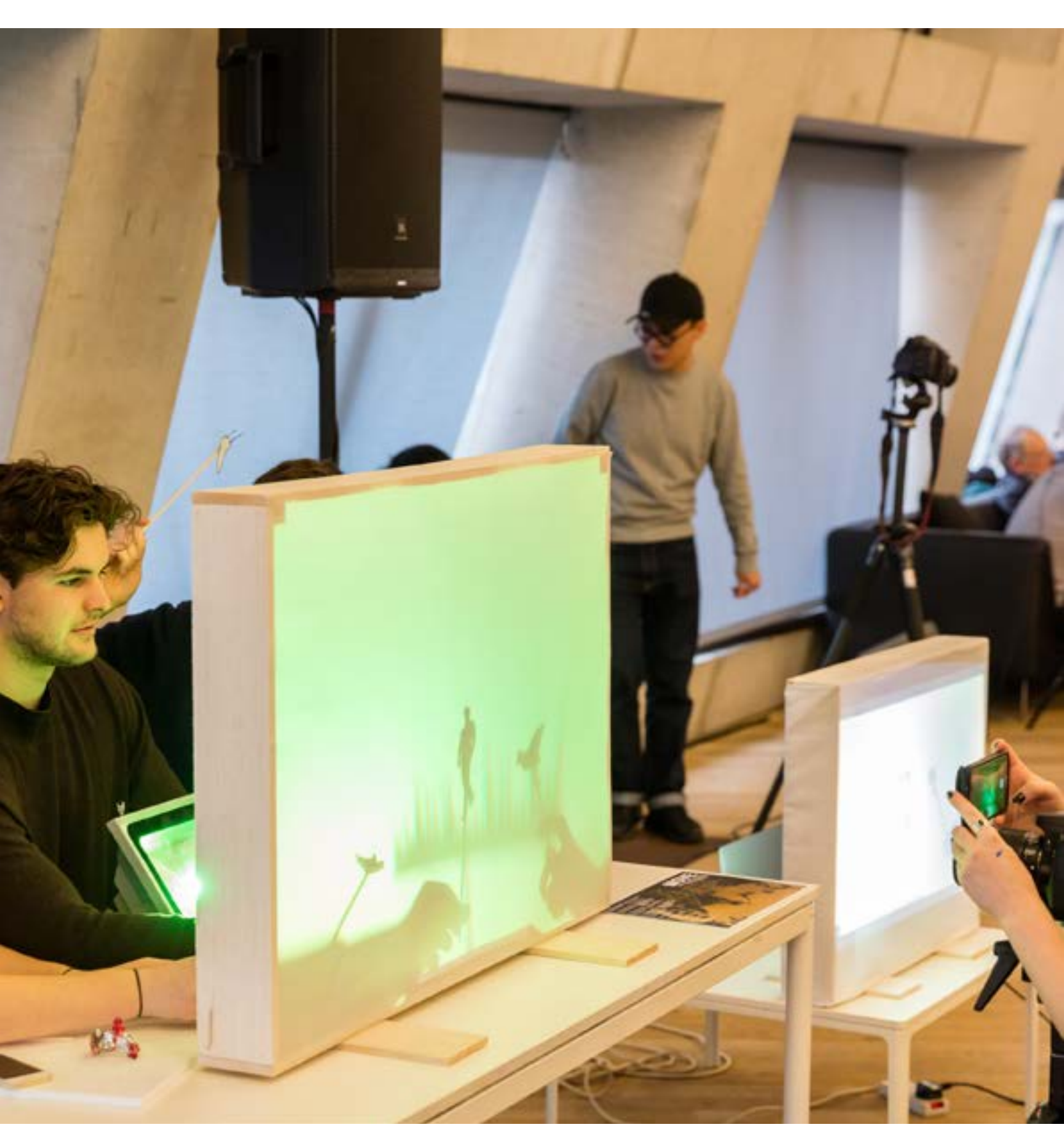
12 / Constructing the House of Daydreams