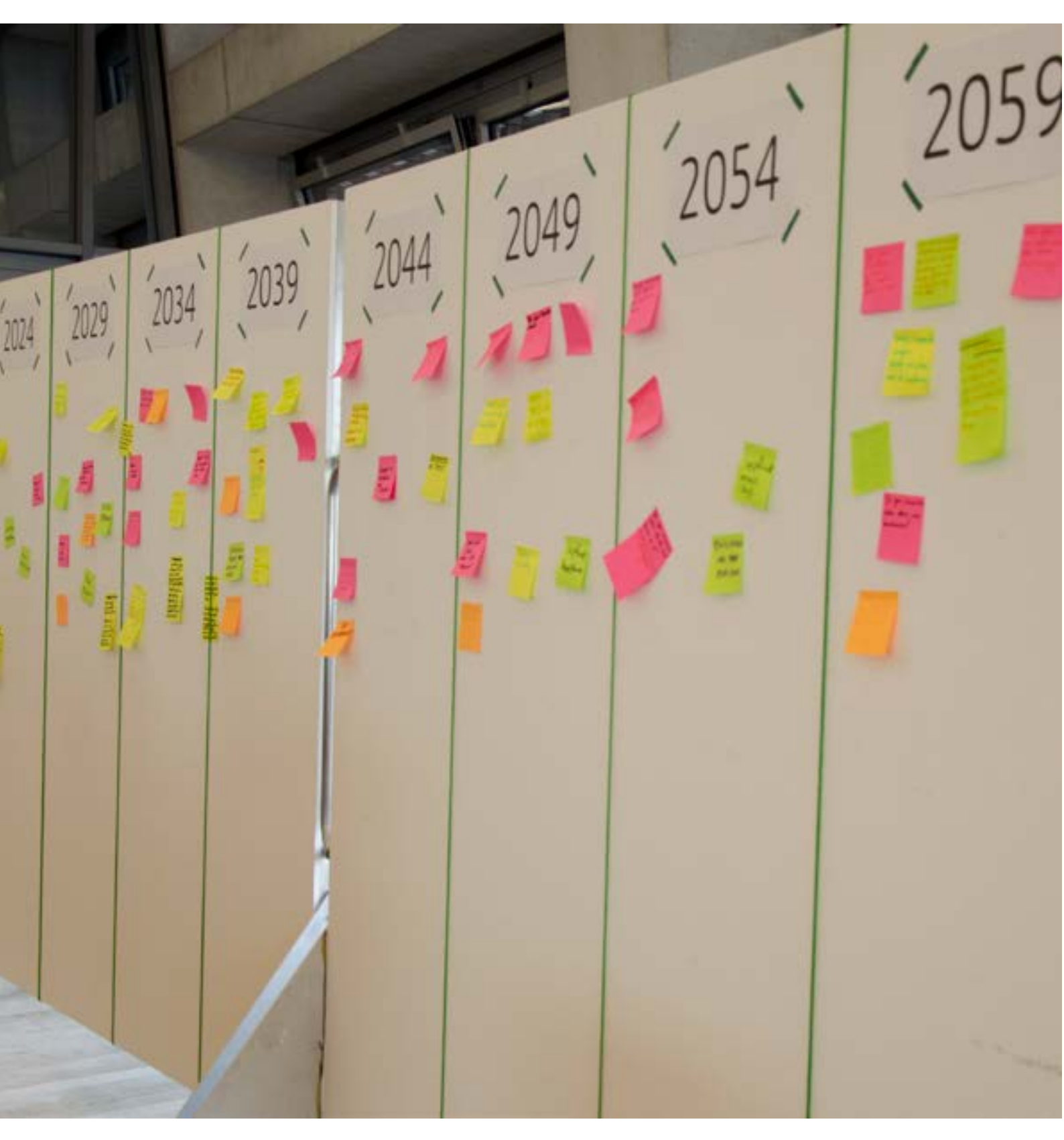
06 /Future Archiving