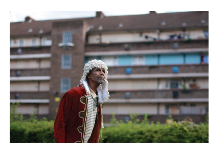
Estate

I had lived on the Haggerston estate in East London for most of my adult life and campaigned for many years alongside other residents to get the buildings repaired. Decades of neglect and intentional underfunding meant that they were in terrible condition. We were not successful in saving them and, once I knew that the estate would soon be demolished, I started filming.