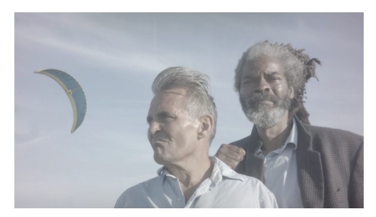
Here for Life, Zimmerman, Jackson, Artangel

My intention in each work has been to create what I could call an activating metaphor; an image or concentration of form that is both actually itself undeniably in the world and also an energising metaphor of larger concerns. In Taskafa , it is the canine; in Estate , the building; in Erase and Forget , military conflict—both overt or covert—speaks to many other ruptures. And in Here for Life , the squatted performance ground holds and meets the marginalised bodies / lives of the film's performers.