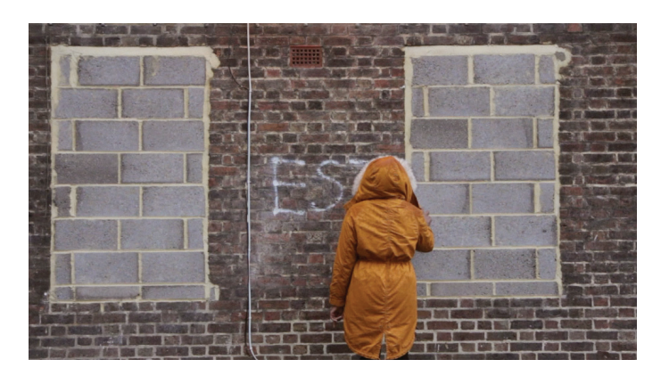
Estate, Fugitive Images

Today the vast majority of dominant cinema, regardless of genre, mode or even thematic concerns, feels like a childhood toy: something to hug, something to remember fondly, something that finally reassures, and which, as a result, can effectively be forgotten. It has lost its activating fuse, producing an international cinematic conservatism and passive audiences, upholding what film-maker Peter Watkins as long ago as 1967 termed the 'monoform': a delivery structure where all the complexities of life, society and history, regardless of the severity, mundanity or grace of the themes, are reduced into the same formal narrative engine, as predictable and recognisable as a famous fast food chain, and offering a similar 'comfort'.