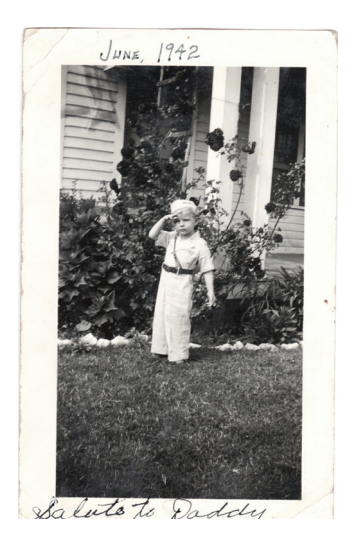
Erase, courtesy of Bo Gritz

spectacular renditions of that policy's effects, and Gritz's own film record of one of the covert operations that embodied the policy's strategic implementation. This record becomes an element in the public construction of Gritz's character, used as it is in the local Channel 8 news report. This construction erases—precisely through violent spectacle—the actual violence of which Gritz was an agent. Gritz participates in this violence through the directorial relationship he forges between himself and Rambo as a fictional character, which finally entails reducing his utterances to fictional clichés.