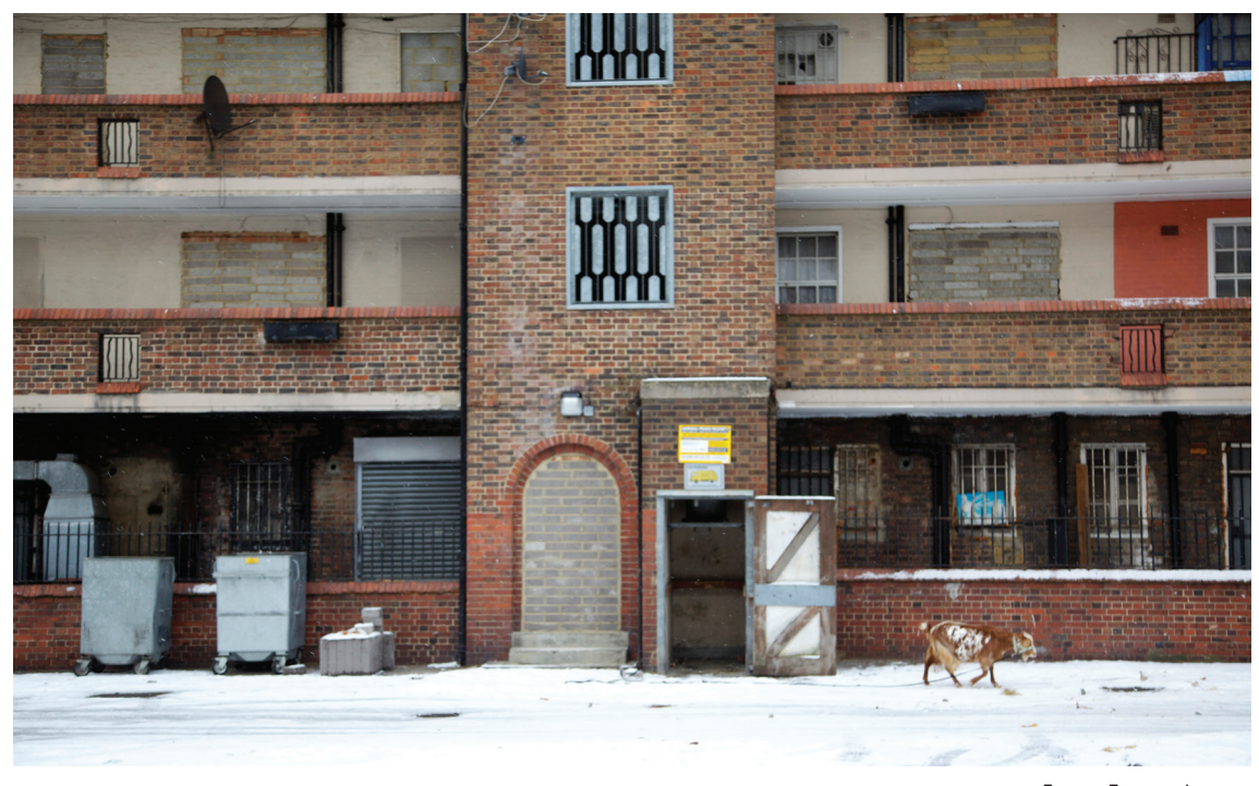
Estate, Fugitive Images

Throughout, my approach has been socially collaborative, in content, form and production. Formally, my films seek to open (for both the participants and audience) a space for consideration of the shifting border between documentary and fiction, using long-term observations, interventions in real-life situations, re-enactments, found materials, archival traces and 'always the honouring of lived experience.' I seek an ethically engaged, culturally resonant expression of shared humanity, and a co-existence with larger ecologies (beyond human-centred subjectivity).