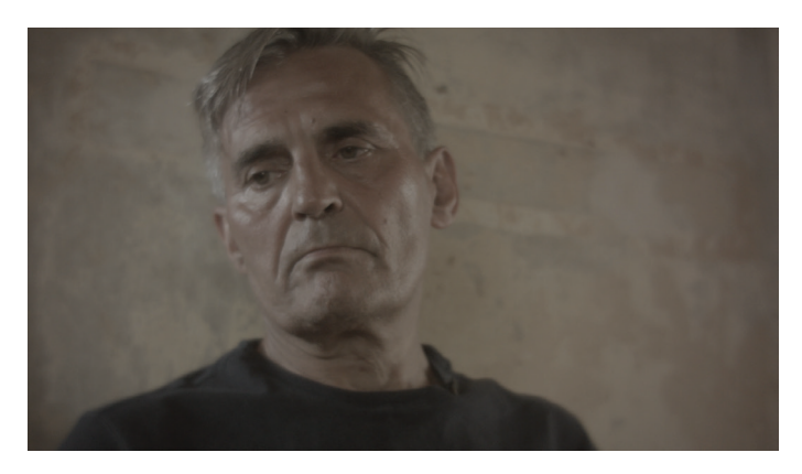
Here for Life, Zimmerman, Jackson, Artangel

They dance together, steal together, eat together; they agree and disagree, celebrate their differences and share their talents. They cycle, they play, they ride a horse. The lines between one person's story and another's performance are blurred and the borders between reality and fiction are porous.