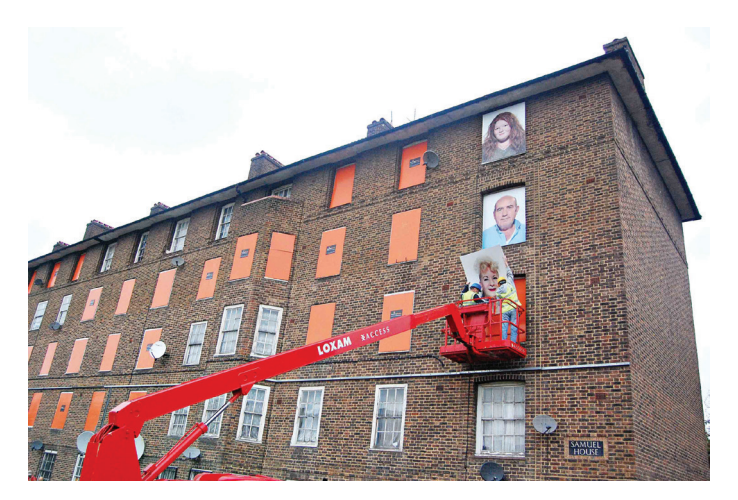
Estate, Fugitive Images

Estate, a Reverie speaks to and of a city long inhabited by a huge diversity of communities (whether focussed around ethnicity, nationality, belief, gender or sexuality, and not forgetting, of course, finance, class and vocational groupings), a territory whose complex identity is at stake within the unfolding and accelerating narrative of globalised gentrification or 'development'. It is a zone whose buildings, functions and populations are being challenged by 'incursionist' forces—of speculative capital, architecture and commerce—threaten the current spectrum of ways of being in this location.