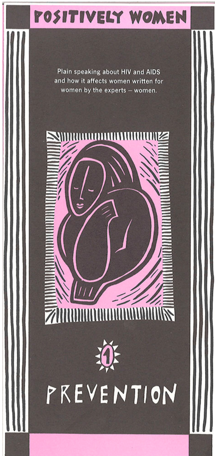
Positively Women, 1. Prevention, 1994: Leaflet. Illustration by Jane Shepherd, Design by Néna Carney © Positively Women.