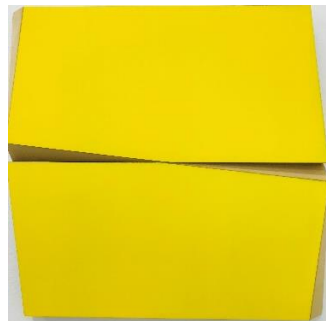
Sean Shanahan, Untitled 2018