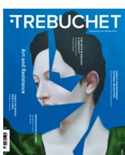
03: Art and Resistance