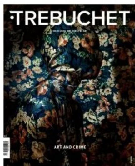
05: Art and Crime