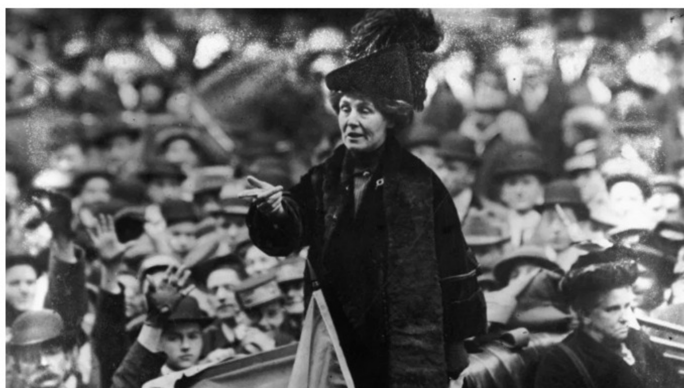
Suffragette Emmeline Pankhurst

It's 100 years since (some) women were given the vote. This came from a long and often bloody fight with authorities; we take great pride in those women and rightly so. Perhaps we should see decolonisation as a similar fight for the inclusion of new values into the canon?