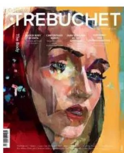
04: The Body