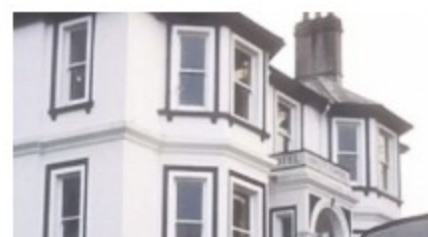
If You Can't Get a Job Start a Business 17/07/2010 In "Society"