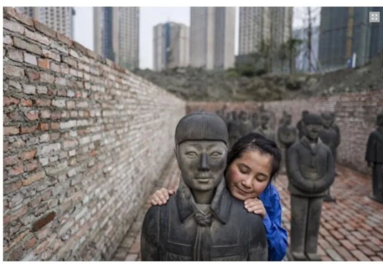
Earth Ceremony performance, Terracotta Daughters burial, Mainland China, 2015

The fact that these pleasing full bodied portraits are buried and will be excavated when the imbalance hits a peak in 2030 adds to the collective cathartic experience the artist is going for and gives the piece the sober gravitas of a monument, a monument to a problem the artist clearly feels will still be in full swing years from now! One can imagine she has gained friends and made enemies in the process, mining this sensitive seam of the culture.