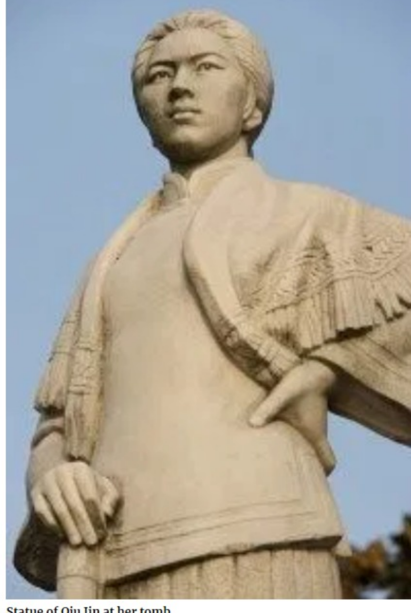
Statue of Qiu Jin at her tomb

Primo-Terracotta Daughters' Qiu Jin (1875 – July 15, 1907) was a Chinese revolutionary, feminist, and writer, she was beheaded at 31 for defying the Qing dynasty following a failed uprising against the authorities. Qiu Jin is praised as a heroine in China statues and museums celebrate her achievements. An educated and courageous woman who simply wanted a better lot for her sex, who in many cases were still having their feet bound (a crippling alteration made for aesthetic purposes) and whose rights lagged far behind those of men.