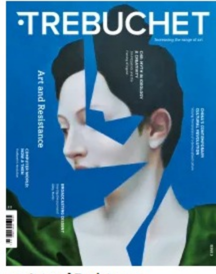
03: Art and Resistance