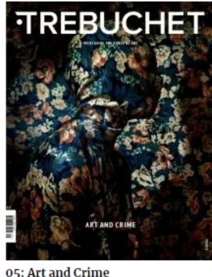
05: Art and Crime