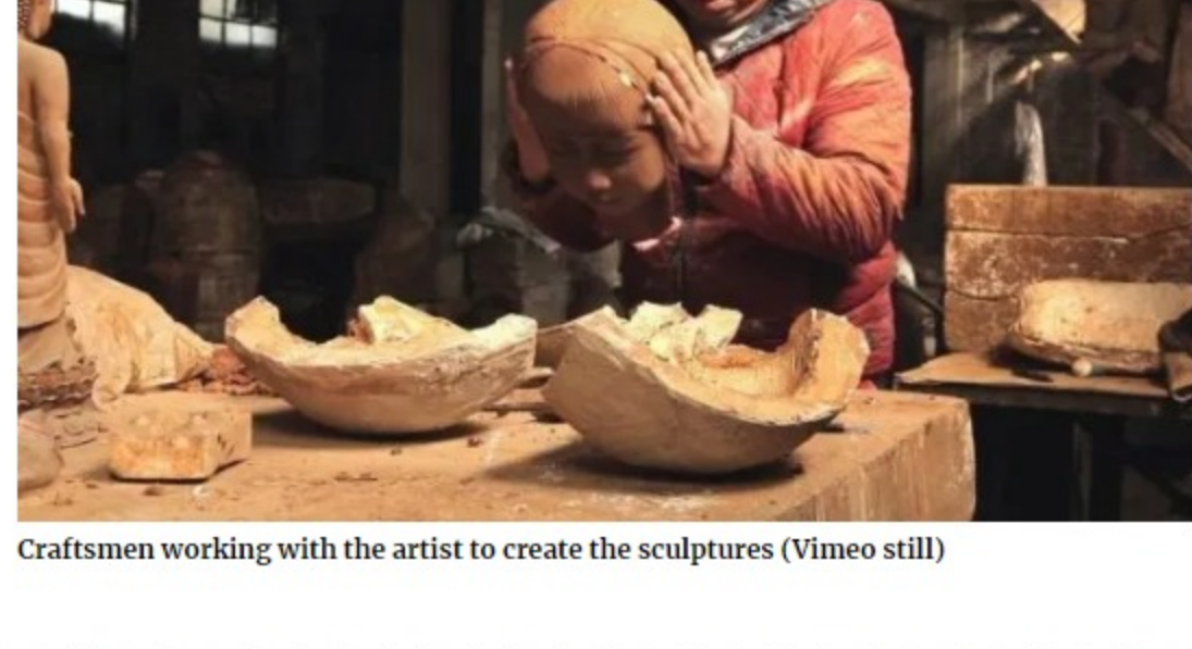
Craftsmen working with the artist to create the sculptures (Vimeo still)

Insult is added to injury and the lack of agency is clear! We need more Qiu Jins and more Prune Nourrys, to redress this balance effectively as well of course, as the support of the many Chinese men who cherish their daughters as much as their sons.