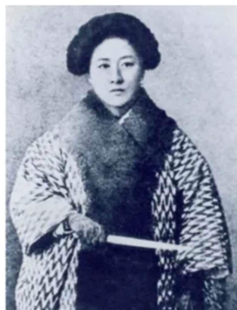
Qiu Jin

This legacy is worth remembering in the centenary celebrations here in the UK regarding women's suffrage and voting rights. If we make woman like this famous then attitudes and political actions will improve across the globe. Sometimes these values are forgotten or worse buried under outdated, wrongheaded views.