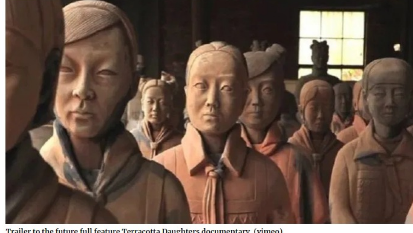
Trailer to the future full feature Terracotta Daughters documentary. (vimeo)

Primo-Terracotta Daughters' Qiu Jin (1875 – July 15, 1907) was a Chinese revolutionary, feminist, and writer, she was beheaded at 31 for defying the Qing dynasty following a failed uprising against the authorities. Qiu Jin is praised as a heroine in China statues and museums celebrate her achievements. An educated and courageous woman who simply wanted a better lot for her sex, who in many cases were still having their feet bound (a crippling alteration made for aesthetic purposes) and whose rights lagged far behind those of men.