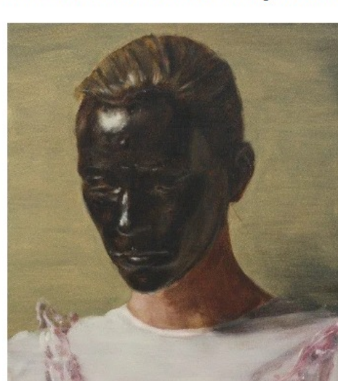
Michael Borremans, The Angel, 2013, 83 x 71 cm, oil on canvas

There is something muted and melancholic about the images, the colour brings to mind Michael Borremans and emphasizes the ambiguity of the paintings.