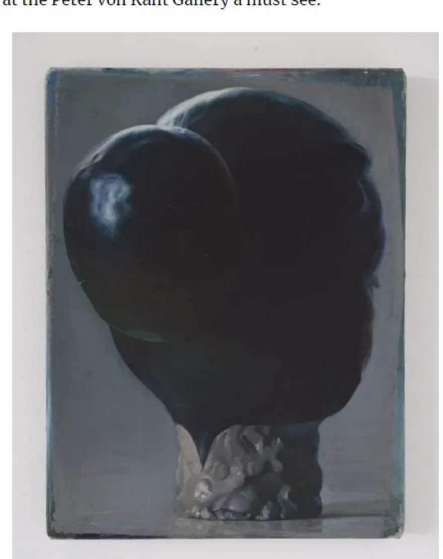
Vampiris (Love Theme), 2013

Janus is a mythic figure present in the Roman tradition, often depicted with two faces as he looks to the future and the past. Janus was the god of duality, of doorways, beginnings and endings these are the obsessions which drive this practice and make the exhibition at the Peter von Kant Gallery a must see.