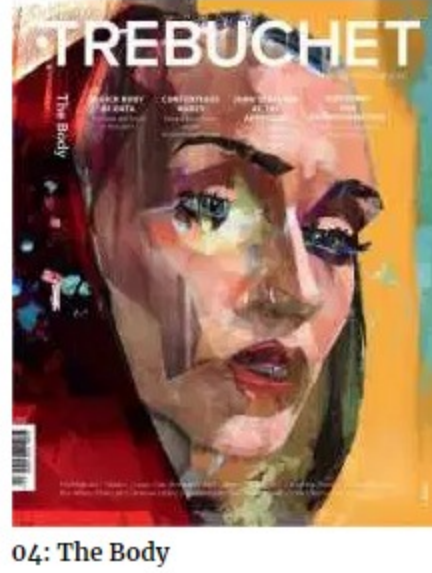
04: The Body