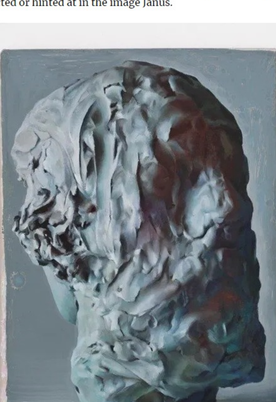
Janus, 2013 Oil on linen on board 44 x 32

The sense of time passing is also present in the works which sometimes have a look of something degrading or from the distant past this feeling of distant past and digital future is reflected or hinted at in the image Janus.