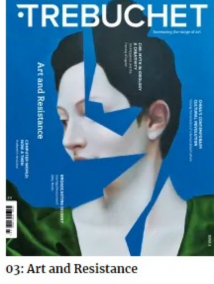
03: Art and Resistance