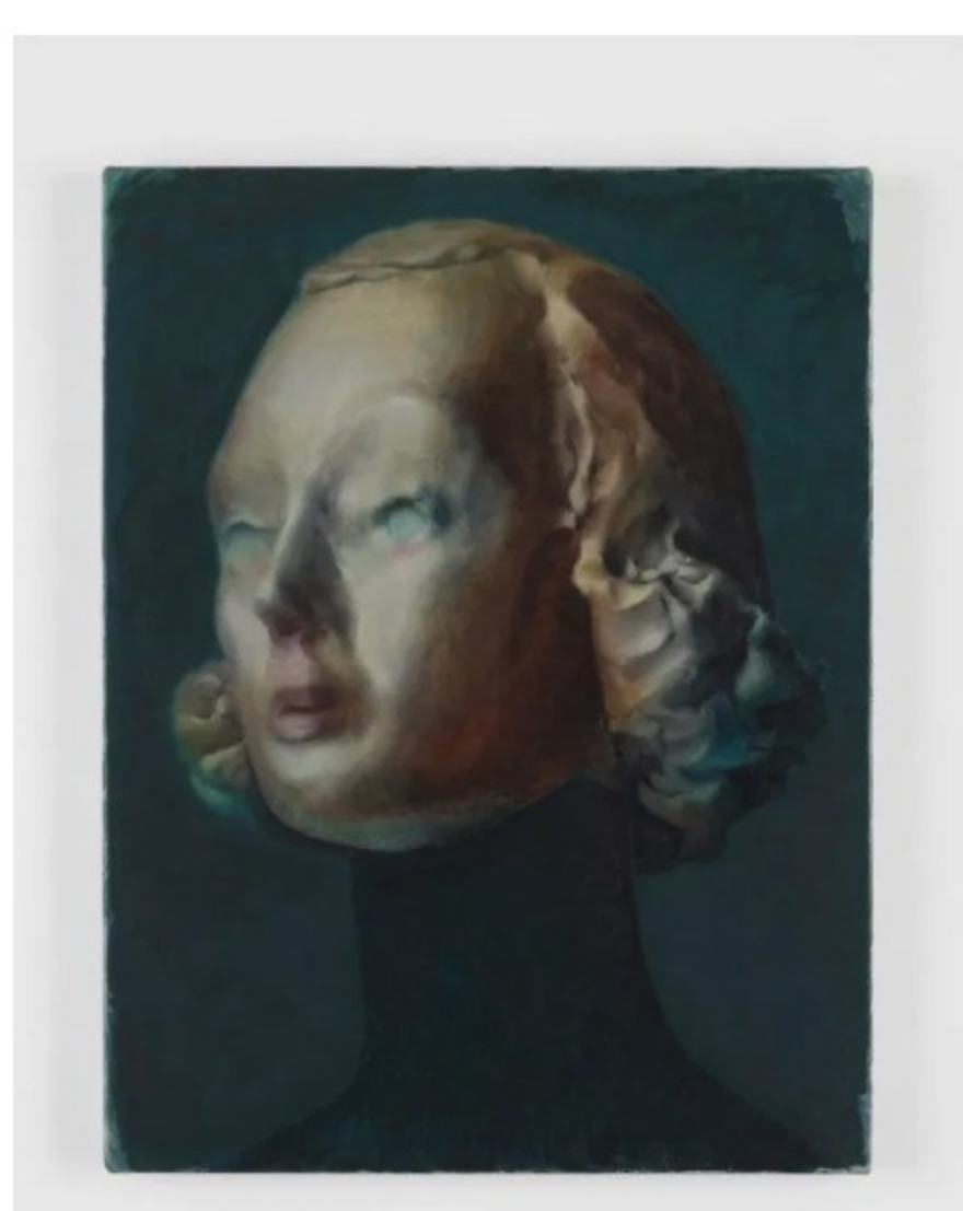
DamienMeade Untitled 2018 56x42.5cm

"Damien Meade's paintings begin as mud, but live on as creatures of dirt. Minerals suspended in water are made compact—first by time, then the artist's hand—and transform into something that Meade cannot, or at least does not want to name. Paint shifts onto linen panels like dried-up play doh curling at its edges, creating what looks like hair, pairs of lips or the surface of skin, perhaps. In an unusual twist of tradition, this clay will never see the inside of a furnace. Instead, it stays wet and, once he is through, will be crushed and churned into the shape of Meade's next model," Olivia Fletcher