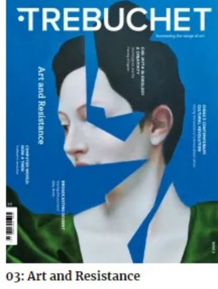
03: Art and Resistance