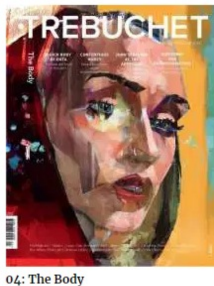
04: The Body