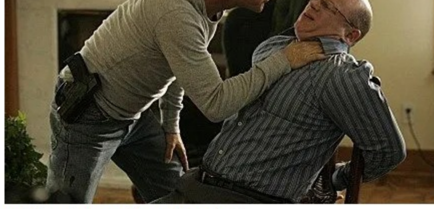
Jack Bauer interrogating a witness in 24

Never the less torture exists and has been practiced by many states for its practical benefits. In recent times we have been bombarded by representations of the practical benefits of torture think of 24,