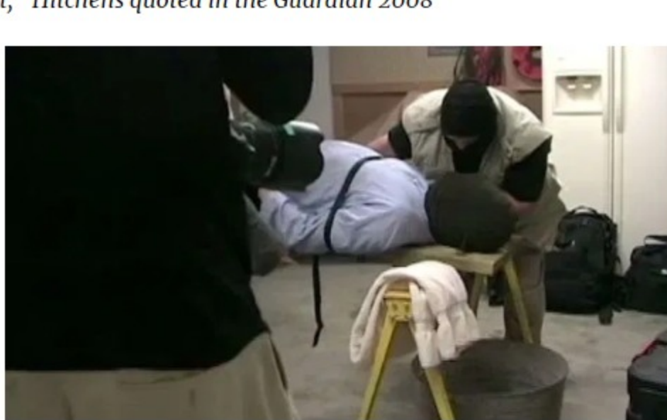
Christopher Hitchens Water boarded by special forces experts

"...on top of the hood, three layers of enveloping towel were added. In this pregnant darkness, head downward, I waited until I abruptly felt a slow cascade of water going up my nose ... I held my breath for a while and then had to exhale and - as you might expect - inhale in turn. "That, he says, "brought the damp cloths tight against my nostrils, as if a huge, wet paw had been suddenly and annihilatingly clamped over my face. Unable to determine whether I was breathing in or out, flooded more with sheer panic than with water, I triggered the pre-arranged signal" and felt the "unbelievable relief" of being pulled upright," Hitchens quoted in the Guardian 2008