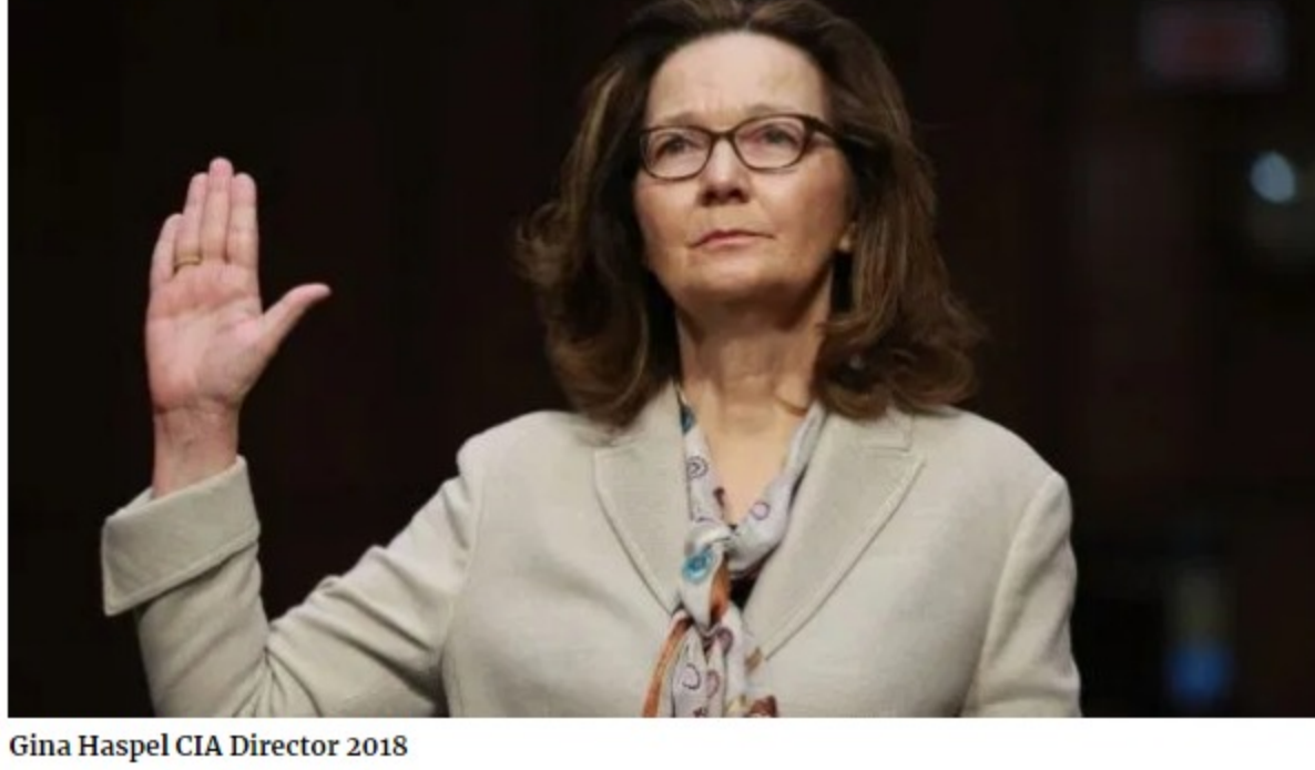
Gina Haspel CIA Director 2018