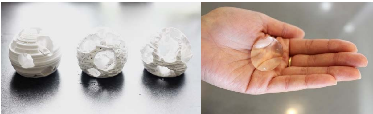
Figure 2. Coral3 by Nell Bennett – Figure 3. Ooho! by Paslier, Couche and Garcia Gonzalez