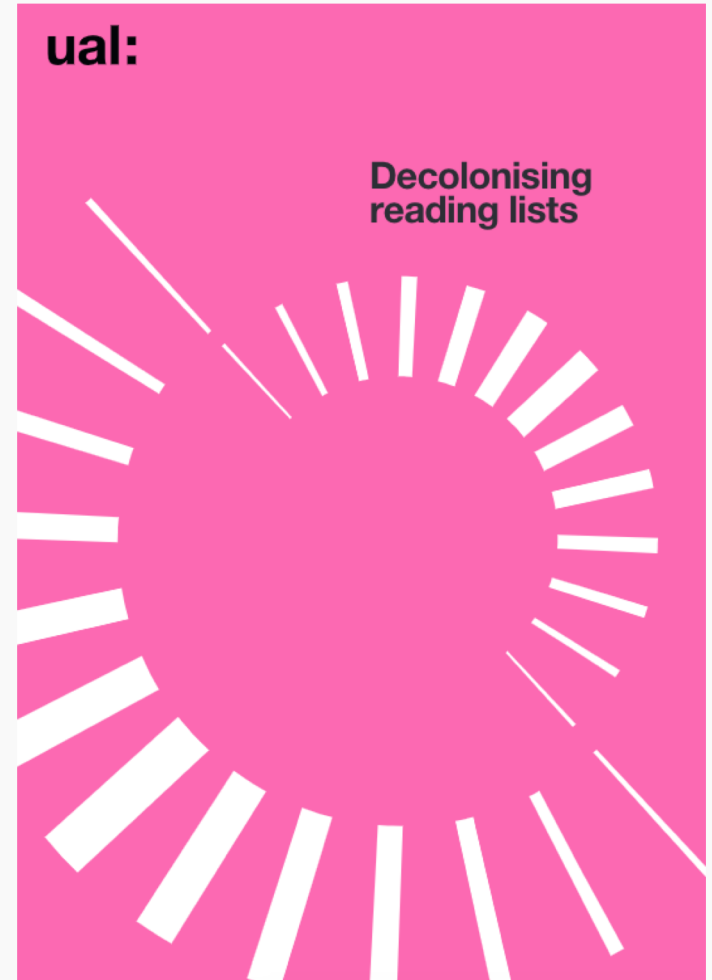
AEM Tool for Decolonising Reading Lists