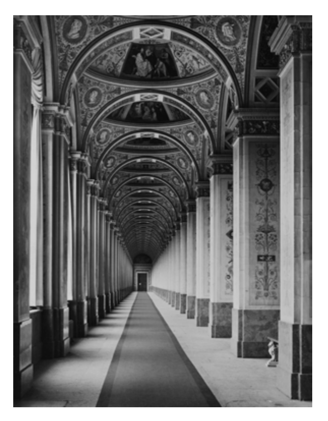
View of the Alte Pinakothek loggia in 1930, before the destruction in the Second World War. Bayerische Staatsgemäldesammlungen, Munich

FNG Research Issue No. 4/2020. Publisher: Finnish National Gallery, Kaivokatu 2, FI-00100 Helsinki, FINLAND. © All rights reserved by the author and the publisher. Originally published in <a href="https://research.fng.fi">https://research.fng.fi</a>