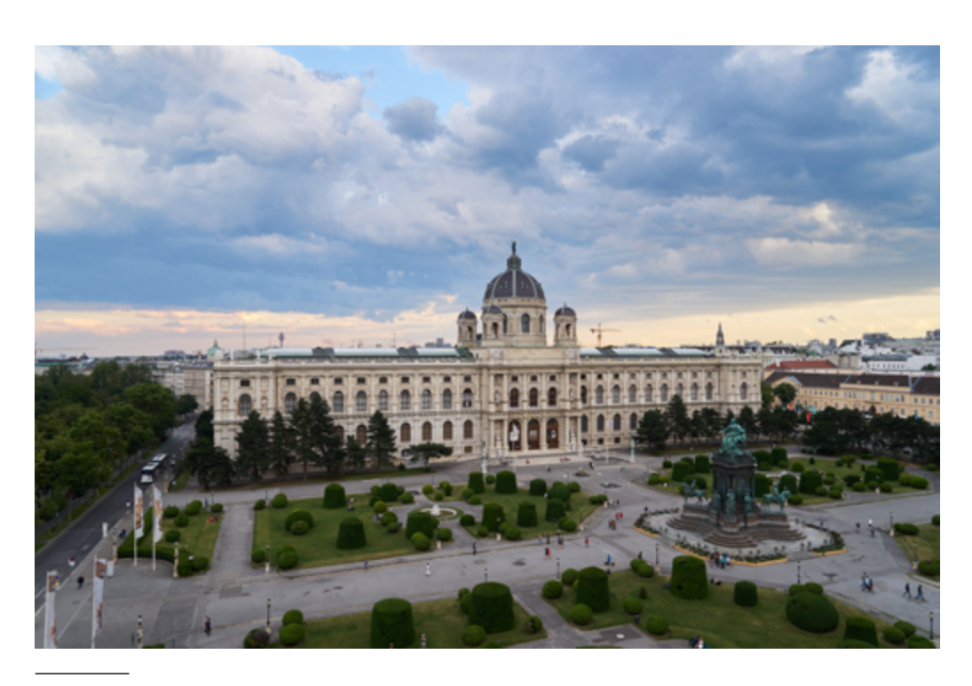
Kunsthistorisches Museum in Vienna, built between 1871 and 1891

FNG Research Issue No. 4/2020. Publisher: Finnish National Gallery, Kaivokatu 2, FI-00100 Helsinki, FINLAND. © All rights reserved by the author and the publisher. Originally published in <a href="https://research.fng.fi">https://research.fng.fi</a>