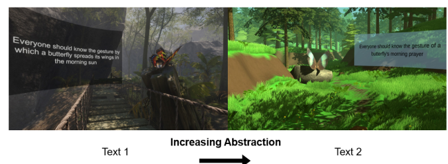
Figure 2: Accompanying text can help modulate the level of abstraction of the interaction