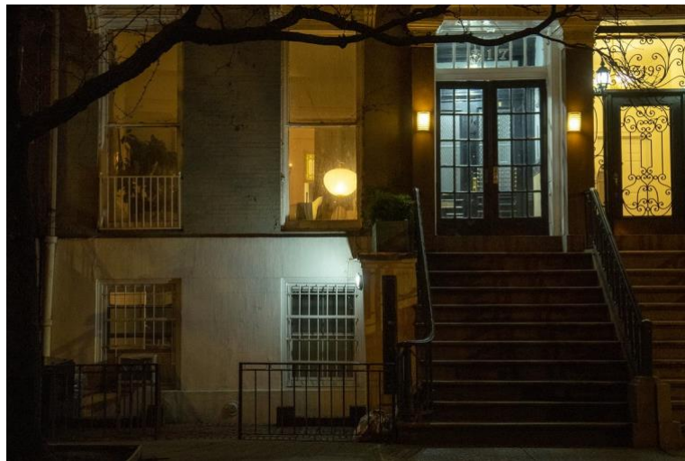
Figure 2 East Village Home, New York, April 13, 2020. From the series “Covid Nights.”