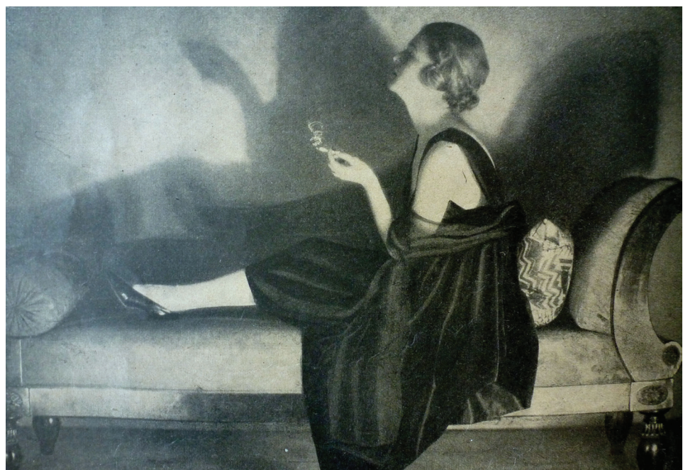
2 Studio Alexander Binder, Anita Berber, die dämonische Tanzvirtuosin in einer Kunstpause [Anita Berber, the demonic dance virtuoso taking an artistic break], photograph published in Elegante Welt, vol. 9, no. 1, January 1920.

In his essay Kracauer explicitly linked photography to fashion, since a photograph is 'bound to time in exactly the same way as fashion'. 7 Referring here to fashion as artifact, he put forward the idea that an outdated dress in a photograph 'protrudes into our time like a mansion from earlier days that has been marked for destruction'. 8 This is what was at stake for the portrait painter: by painting fashionable women, he would risk exactly that for his art. Not just the appearance and identity of the