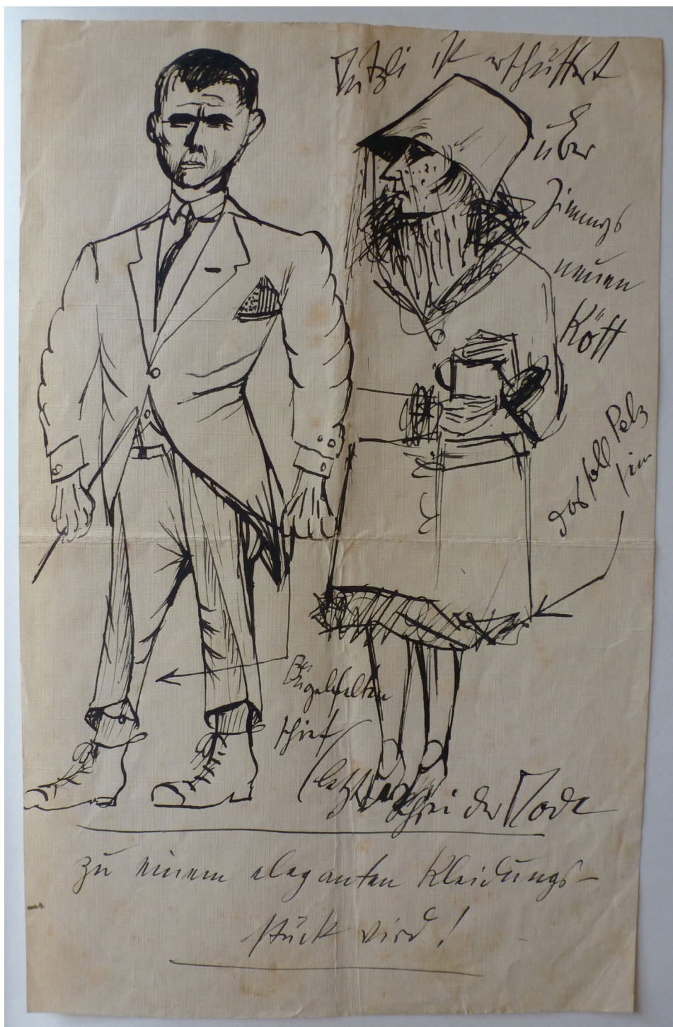
7 Otto Dix, Untitled, 1921. Ink on paper, 18.9 × 29.8 cm. Vaduz: Otto Dix Stiftung. © DACS, London.