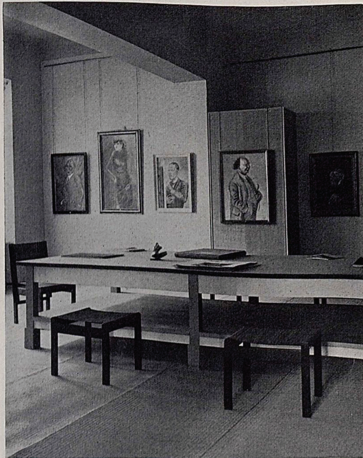
BLICK IN DIE ERSTE GESAMTAUSSTELLUNG VON OTTO DIX (1926) DER GALERIE NEUMANN-NIERENDORF, BERLIN W 35

17 View of the Otto Dix exhibition at Galerie Neumann-Nierendorf, Berlin, 1926, reproduced in Otto Dix, exh. Cat., Berlin: Galerie Neumann-Nierendorf, 1926.