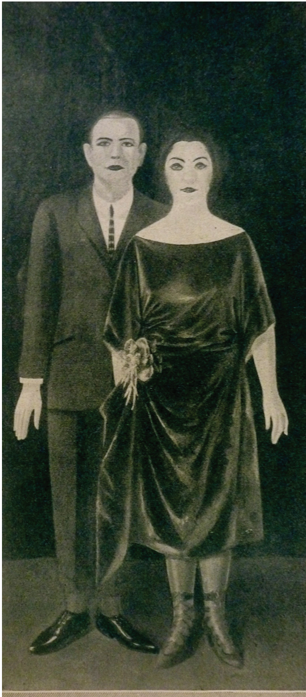
15 Anonymous, Ein interessantes Doppelbildnis von O. Dix aus der 'Juryfreien Kunstschau' in Berlin, photograph published in Die Dame, vol. 50, no. 7, January 1923.