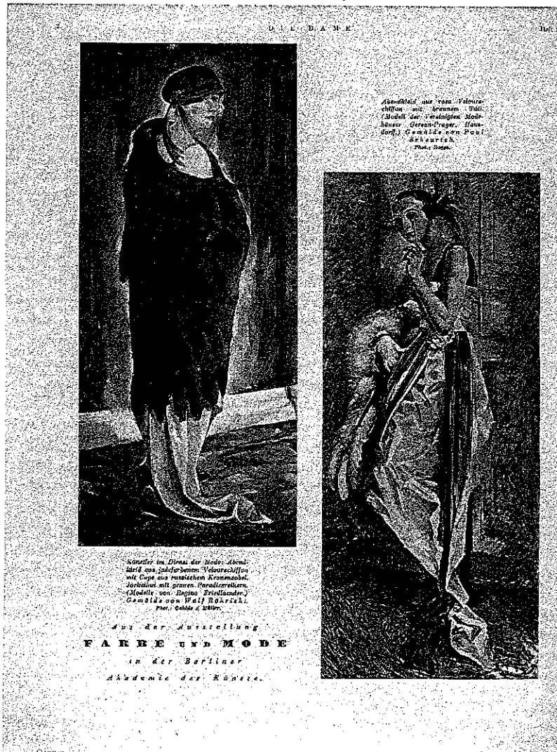
Fig. 2: Berlin in 1921: the exhibition Farbe und Mode organized by the Verband der Deutschen Mode-Industrie, the Interessengemeinschaft der deutschen Farbstoffindustrie and the Akademie der Künste on the Pariser Platz, curated by architect and designer Professor Bruno Paul as part of the Berliner Modewoche.

und Künstler, condemned the whole event as a “travesty on fashion and time.” 11 This exhibition included a room with about two dozen painted portraits of fashionable women in contemporary dresses designed by leading Berlin fashion houses, commissioned from well-known painters. The result, according to Scheffler, was “non-artistic mixtures” of fashion and art. What was more, “the concept for this exhibition, the concept of commissions is itself non-artistic.” 12 And he concluded sarcastically: “One leaves the ‘Hall of Beautiful Women’ with the hope that in the future, the academy of arts and the Verband der Deutschen Modeindustrie would keep their distance from one another.” 13