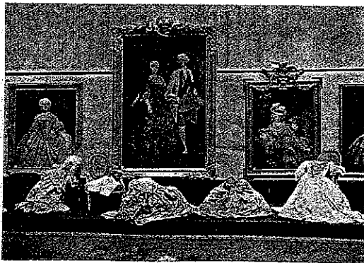
Aus der historischen Abteilung

Das Spätbarock um 1700 mit seinen steifen Kleidformen und prunkhaft schweren Stoffen und Mustern; der Regence-Stil, der auch in der Mode alle Formen leichter macht, die Farben und „Dessins“ auflockert und aufhebt; das zeitige Rokoko mit seiner ründlich-volleren Bewegung, seinem Reichtum an Kontrasten im modischen Umriß, an Leuchtkraft der Farben und Glanz der stofflichen Oberfläche; das späte achtzehnte Jahrhundert in dem Überschwellen der Konturen nach den Seiten und in die Höhe, in der Häufung der Motive und der Freude an der Draperie. Gleichzeitig der Einfluß der Naturempfindung und des „sentiment“ einerseits sowie des Klassizismus mit der anderen Seite, die der Mode schon vor der französischen Revolution einen bürgerlich-gefühlvollen Zug und bald darauf einen antikisch-idealen Charakter geben. Schlanke Gestalten in durchsichtigen, leichten Gewändern mit flüssigen Umrissen verkörpern uns das Modeideal zu Anfang des 19. Jahrhunderts. Doch das bürgerlich Behagliche gewinnt rasch