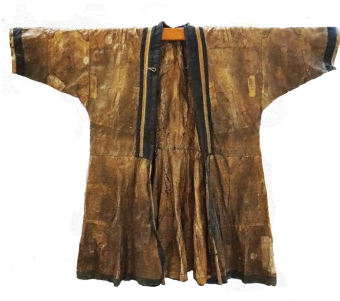
Fig. 4. Ainu fish skin attush. 19th century. Sapporo University Museum. Sapporo, Hokkaido, Japan.