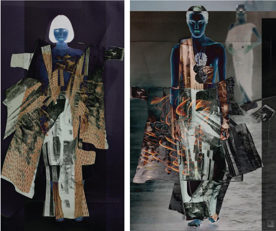
Fig. 8 and 9. "Toolbar" developed by Orit working with collages. Collages by Ran Graber.

toile, (figure 11) and then finally, the replica itself. In the final review, they present their replica and the study, detailing the specific form and function of the garment, its component materials and its continued use, modification, or abandonment in the present day. They also analyze the difference between their replica and the original.