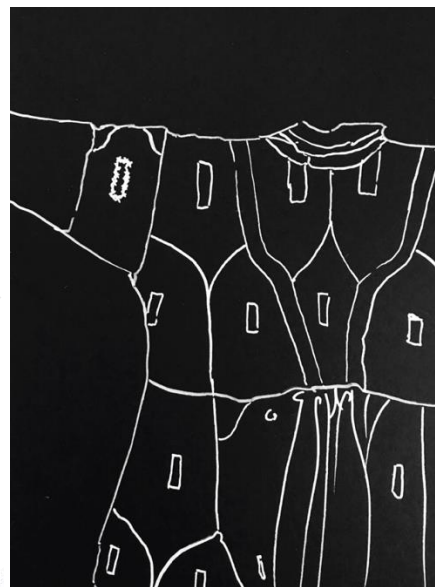
Fig. 5. Painting it in a negative form with white chalk on black paper. Part of Orit’s “toolbar”.

The coat at the centre of this case study, and the focus of Ran’s project, is an Ainu man’s fish skin attush from Sapporo University Museum in Hokkaido, Japan (Figure 4). Fish skins used in the manufacture of garments like this one were softened by being beaten with a wood mallet after they were dry. This coat, which has