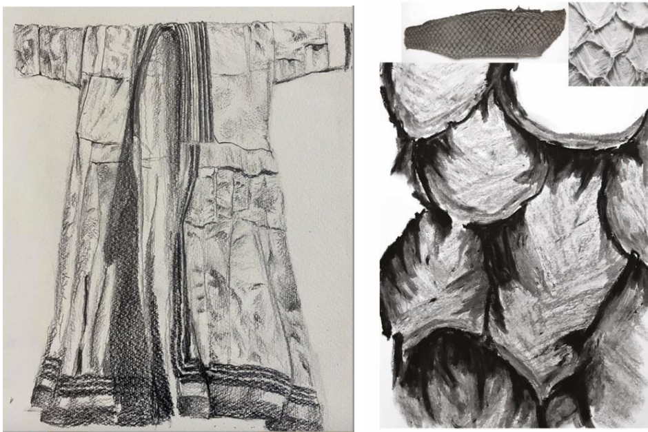
Fig. 6 and 7. Hand drawings of AINU fish skin robe and fish skin scale details by Ran Graber.

In the workshop, the students choose an item they have researched that represents a working garment dating back to the 19th century. From this original they make an exact replica. The replica is made based on the original patterns as gleaned from a study of the object itself in the Rose Archive at Shenkar or taken from images in books and the internet. The process of making the replica is relatively short: 3-4 weeks. The students develop a design process considering a combination of both conceptual and practical methods.