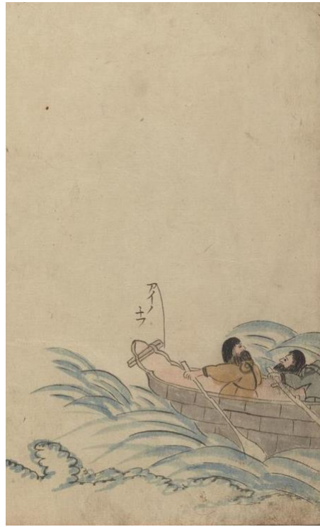
Fig 3. AINU men fishing. Hata, Awagimaru. Ezotō Kikan. Japan 1799. Library of Congress. Washington DC.

Throughout the centuries, fish were the main bounty of the AINU land. The perennial river and lake fish were joined each year by spawning transient newcomers: humpback salmon, chum, taimen and hucho. Natural resources (primarily fish) determined the lifestyle and economic activity of the AINU. Even the pattern of settlement was determined by their fishing habits - mainly in areas of abundant fish stock - on the seashore, in gulfs and at the mouths of rivers, in lagoons or in the centre of islands close to spawning rivers (Takasami, 1998). The AINU placed primary importance on fish as a food resource, fresh in summer and spring, and preserved for later use in winter - when they subsisted on it.