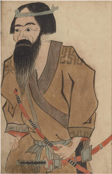
Fig 2. AINU man. Hata, Awagimaru. Ezotō Kikan. Japan 1799.