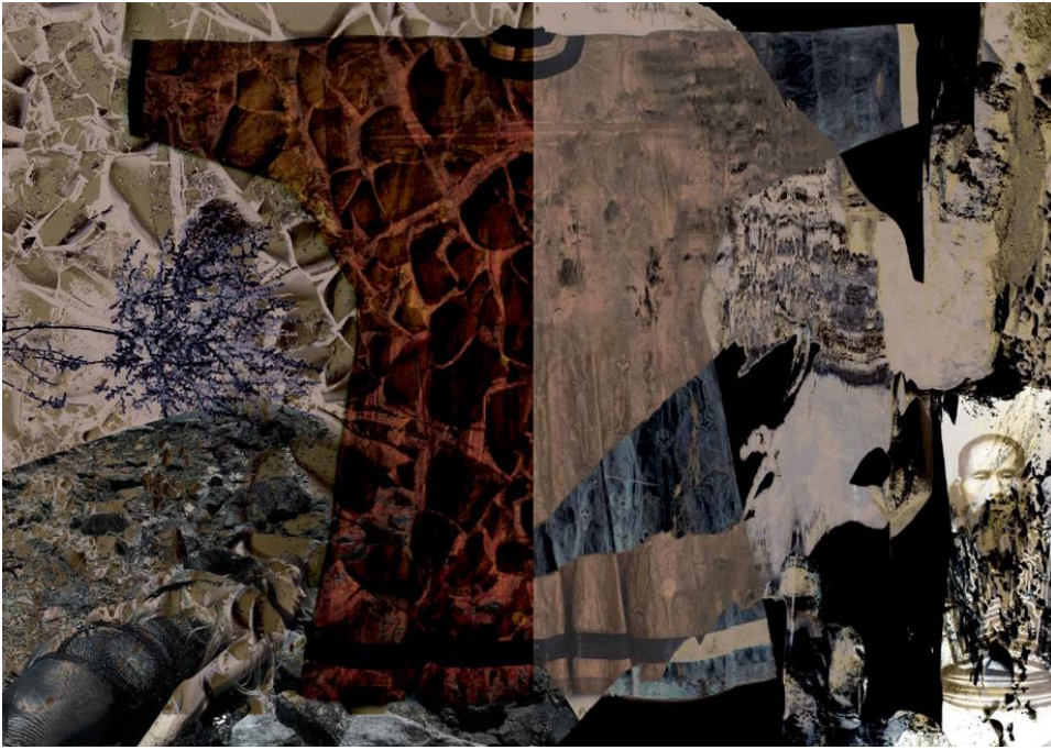
Fig. 1 Ran Graber's sketchbook