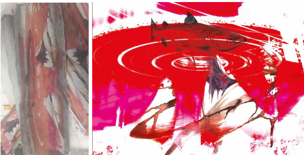
Fig. 14. Digitally printed Fish skin using Kornit's FOF technology Fig. 15 Salmon print by Ran Graber.

Kornit uses another technology called FOF printing ink and their own trademark ingredients. FOF technology can print only on light materials using a light ink on the roll-to-roll machine. FOF gives the advantage to print on non-absorbed skins. The fish skins (figure 14) were printed for free as part of the EU Horizon 2020 funded project FishSkin, 'Developing fish leather as a sustainable alternative within the fashion industry'.