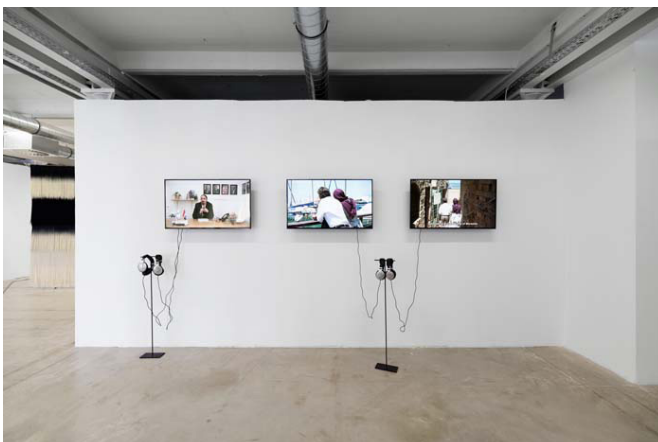
Exhibition view, Vos désirs sont les nôtres , Triangle France, Marseille, 2018.