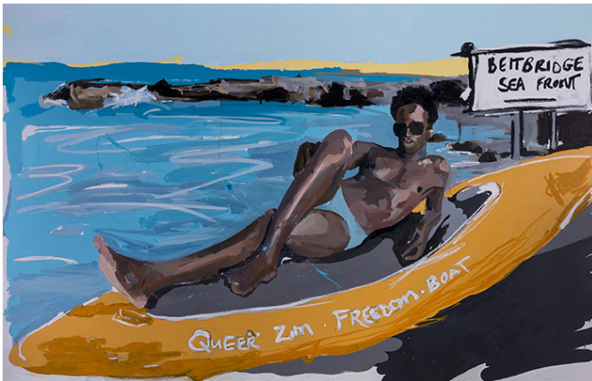
Kudzanai-Violet Hwami , Ain't leaving this country , 2016, acrylic on canvas, 135 x 210 cm. Collection Fondation Blachère.