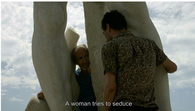
Liv Schulman , L'Obstruction , 2017, video HD, 26 min.