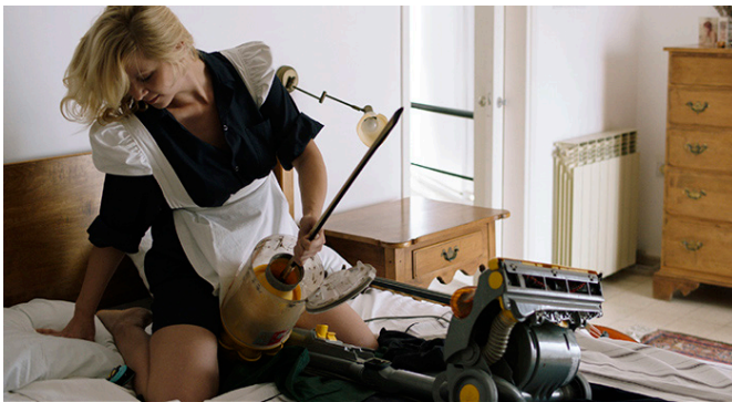
Roe Rosen , The Dust Channel , 2016, video HD, 18 min.