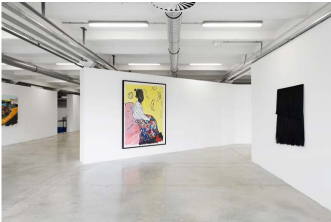
Exhibition view, Vos désirs sont les nôtres , Triangle France, Marseille, 2018.