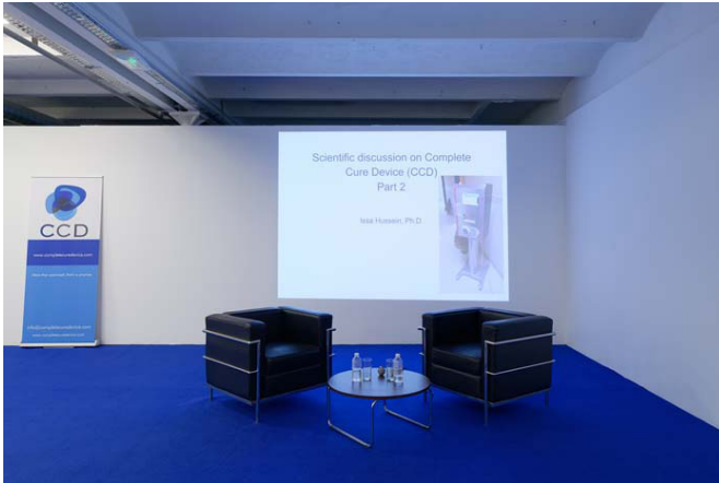
Ghita Skali , Narrative machines: episode 1 , 2018, courtesy of the artist. Exhibition view, Vos désirs sont les nôtres , Triangle France, Marseille, 2018.