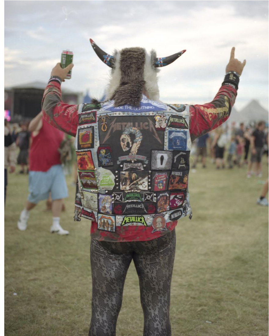
Metallica fan at Sonisphere Festival, UK, 2014