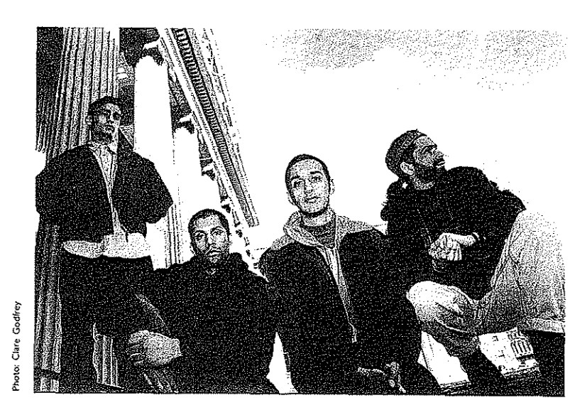
ASIAN DUB FOUNDATION

Another critical rhyme Make you wanna look Observe it It's like a comic book Coming from the place With a capital B I'll let you guess No let me tell you: The B and the A and N and