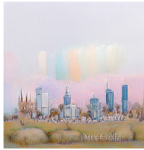
Figure 2: Image generated by the Big Sleep Colab notebook for the prompt “The Melbourne skyline in pastel colours”. Note the appropriate presentation of content and style, and additional pastel strokes in the sky as an unprompted innovation.

• In terms of pre-trained model selection , numerous people have substituted BigGAN with other GAN generators. This creative responsibility could be automated, with the system choosing from a database of GANs and installing new ones into the notebook.